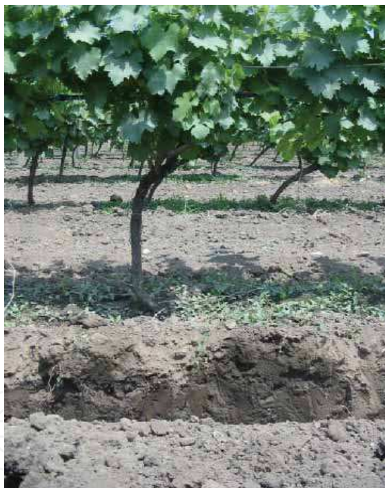
Fig. 3. The watering surface in drip irrigation system