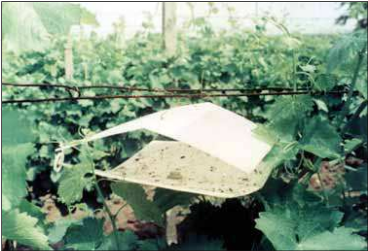
Fig. 1. ATRABOT traps in Columnna experimental plot