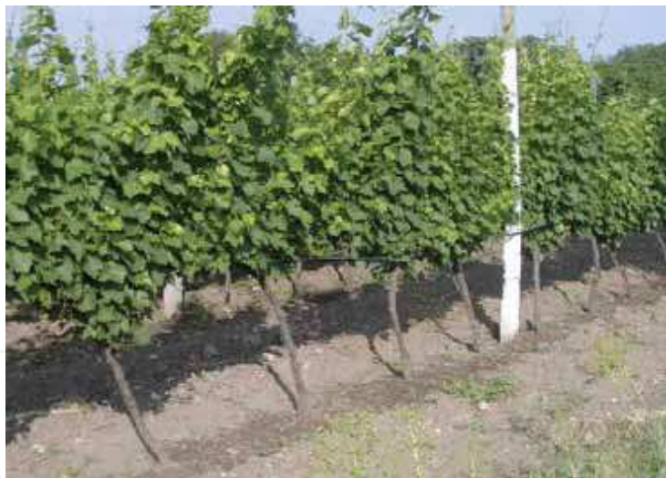
Fig. 2. Dirip irrigation distribution on the plants row in the Columna experimental plot

Distribution is done with tubes PEHD D50 mm respectively 40 mm for the distribution antenna water on the plant rows (figures 2 and 3). After the technological probes and the determining of the functional parameters of the installation will have introduce an automatic programming system.