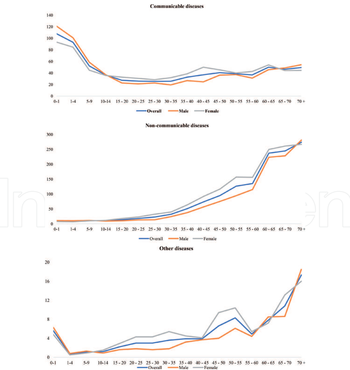
Figure 3. Prevalence of self-reported morbidities by age and sex in India (2014).

Table 1 shows the results of logistic regression analysis by age after controlling the effect of other socio-economic factors. It is evident from the results that the odds of suffering from communicable diseases were maximum in the reference age group. The odds reduced significantly in the adult ages and increased steadily afterwards in the elderly age groups. This age pattern does not change significantly by sex. The lowest odds were observed in the age group of 25–30 (OR, 0.19) and 30–35 years old (OR, 0.20). A significant positive association can be seen between risk of suffering from non-communicable disease and age. The risk of suffering from non-communicable diseases is more than 10 times higher in the age group 40 and above with the highest risk in the age group 70+. The risk of suffering from NCD was 52 times higher for the elderly age 70 and above. Elderly males (70+) have 48 times and