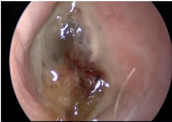
Figure 1. Capillary Hemangioma of the Nasal Septum [5].

Cavernous hemangiomas are uncommon in the paranasal sinuses and nose. It has been defined to originate from the inferior turbinate, vomer, lamina perpendicularis, and sinus maxillaris. Nasal mucosal hemangiomas ought to be distinguished from hemangiomas that originate from the maxilla or nasal bones which are primary osseous lesions, of which the symptoms and surgical approach are entirely different [7–12].