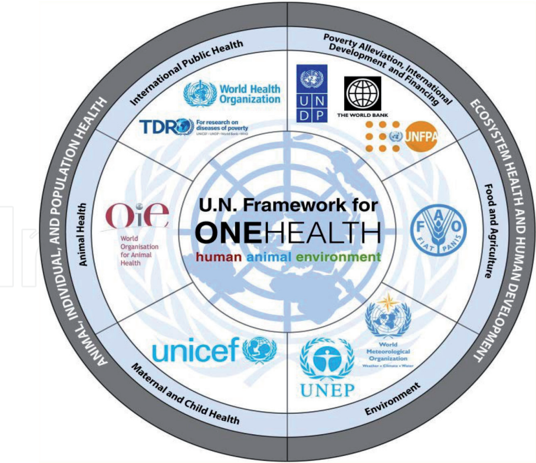
Figure 3. Proposed United Nations “One Health” framework. FAO, Food and Agriculture Organization; OIE, World Organization for Animal Health; TDR, WHO Special Programme for Research and Training in Tropical Diseases; UNDP, United Nations Development Programme; UNEP, United Nations Environment Programme; UNFPA, United Nations Population Fund; UNICEF, United Nations Children’s Fund; WHO, World Health Organization; WMO, World Meteorological Organization.