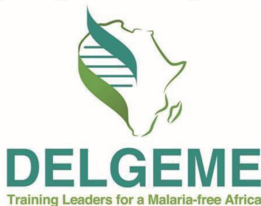
Figure 5. The Developing Excellence in Leadership and Genetics Training for Malaria Elimination in sub-Saharan Africa (DELGEME) program.

Interestingly from last year, genomic education is progressively taking off in Africa. Indeed, many genomic training programs at the countries or regional level are entering in operational phase. Many of them are mainly supported by H3ABioNet which organizes a variety of high quality courses and training events covering various aspects of bioinformatics from general introductory topics to more