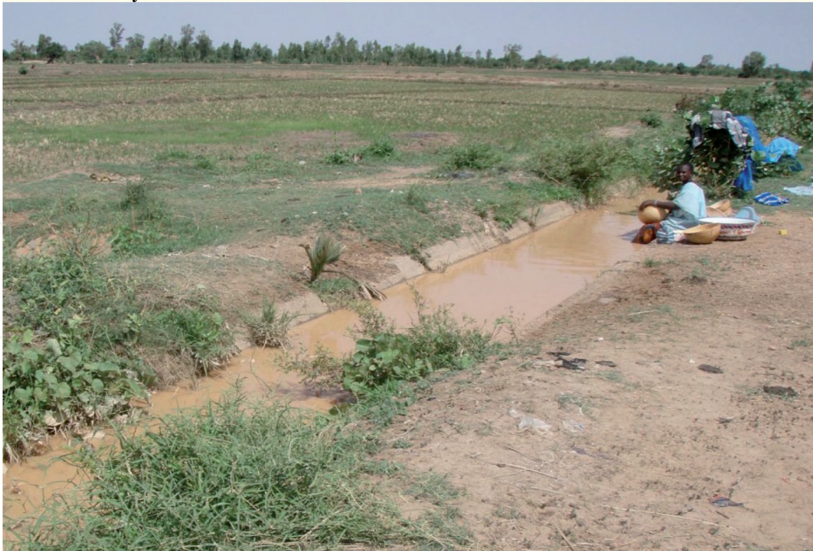
Figure 2. A woman washing dishes in a canal.

of affected women, making them dependent on family members and potentially leading to stigmatization and social exclusion.