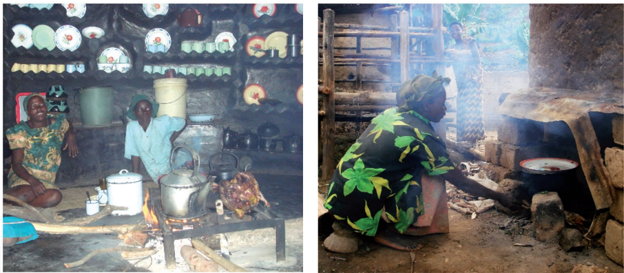
Figure 3. Left: A model CHC kitchen hut in Zimbabwe showing shelving made of clay, individual family utensils and covered drinking water with ladle. Right: In Rwanda, a traditional cooking shelter outside, with no CHC improvements.