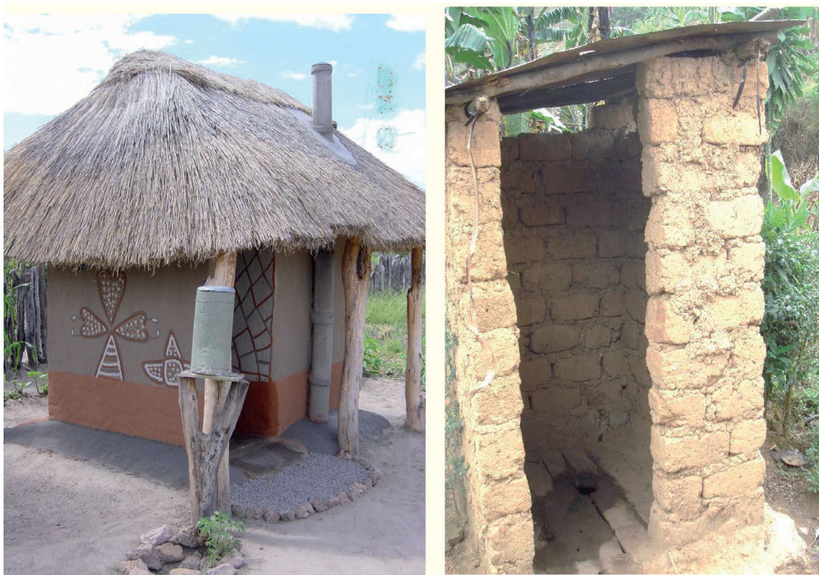
Figure 2. Left: Subsidized ventilated improved pit latrine (VIP) in a CHC home in Zimbabwe with lined pit, concrete slab and vent pipe - a fly trap which eliminates smell and a hand washing facility. Right: An unsubsidized traditional pit latrine in Rwanda, unlined and open pit, log floor giving open access for flies.