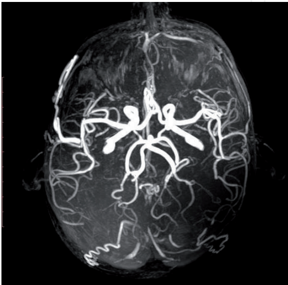
Figure 1. Magnetic resonance angiography demonstrating the arteriovenous fistula.