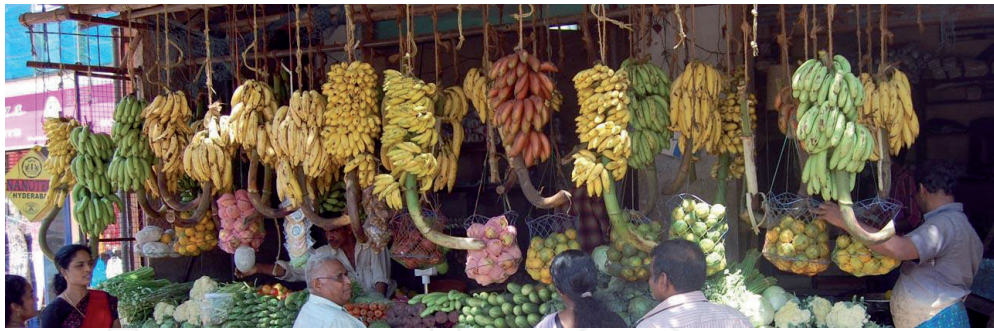
Figure 1. The diversity of banana and plantains with various genome compositions [2].

fourth leading agricultural crop [3]. Banana is said to be among human foods which was introduced in the first century. The fruit is cultivated in more than 130 countries throughout tropical and subtropical regions with over a harvested area of approximately 10 million hectares [4]. Furthermore, countries in Latin America such as Ecuador and Columbia have been reported to be major producers of the fruit, while the United States and European Union import the highest amounts of banana [4].