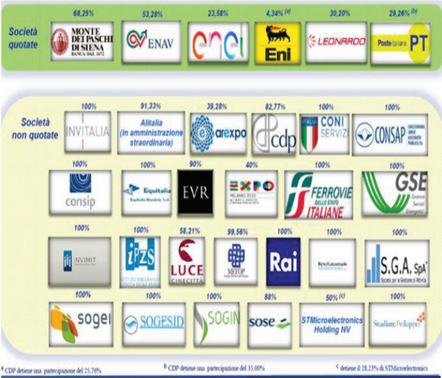
Figure 1. Public companies currently controlled by the Ministry of the Economy and Finance.

Uniformity has given way to the diversification of models, envisaging a system of administration no longer revolving around the State-apparatus, but inspired by the principle of institutional pluralism, by virtue of which alongside the State, the public body par excellence and other subjects operate and are endowed, as well as of private juridical capacity, also of public juridical capacity, which pursue aims of public interest.