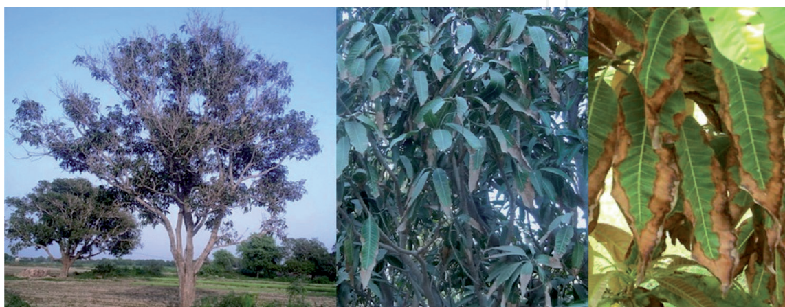
Figure 2. Anthracnose disease ( Colletotrichum gloeosporioides Penz.).

Mango suffers from several infectious diseases caused by many phytopathogens. More than 83 different diseases and disorders including 52 fungal, 3 bacterial, and 3 plant-parasitic nematodes of the mango tree and fruit have been recorded worldwide which cause losses; however, fortunately no single disease is caused by the virus till now in mango [27, 28]. Twenty-seven diseases have been reported in mango trees of Pakistan [28]. Among them the main diseases are anthracnose, Colletotrichum gloeosporioides (Penz.) ( Figure 2 ); powdery mildew, Oidium mangiferae (Bert.) ( Figure 3 ); malformation, Fusarium spp. ( Figure 4 ); bacterial leaf spot, Erwinia mangiferae (Doidge) ( Figure 5 ); crown gall, Agrobacterium tumefaciens ( Figure 6 ); sooty mold, Capnodium mangiferae ( Figure 7 ); fruit rot, C. gloeosporioides and Aspergillus niger ( Figure 8 ); root rot, Rhizoctonia solani (Kuhn) and F. oxysporum (Schl.) ( Figure 9 );