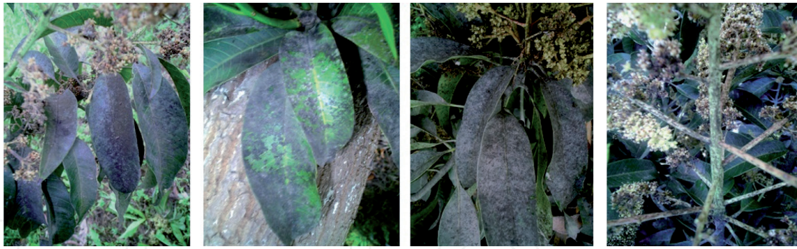
Figure 7. Sooty mold ( Capnodium mangiferae ).