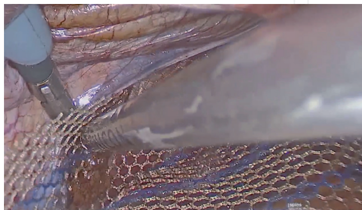
Figure 1. Positioning the mesh in inguinal area.

Rhambia et al. in 2016 also conducted a comparative study between these techniques; they found that there is no significant difference between them in the