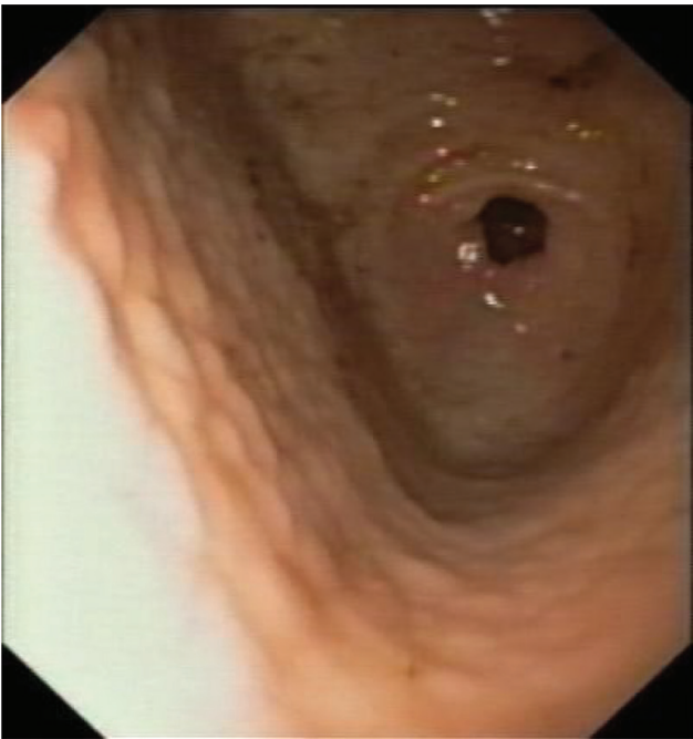
Figure 2. Endoscopic aspect of Helicobacter pylori gastritis in children (macroscopic nodular antral gastritis).