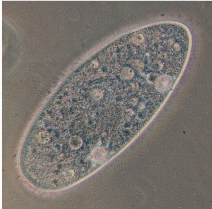
Figure 2. Paramecium tetraurelia [41].

micronuclear chromosomal DNA contains the genetic information that is inherited from one generation to the next, whereas the macronucleus contains many chromosomal DNA copies that express cellular functions. P. tetraurelia is able to undergo both asexual and sexual reproduction. Asexual reproduction occurs by binary fission in which the micronuclei divide by mitosis and the macronucleus divides by amitotic division [40]. Sexual reproduction involves a meiotic process, either automixis or conjugation. Automixis is a kind of self-fertilization, whereas conjugation involves mating with another individual.