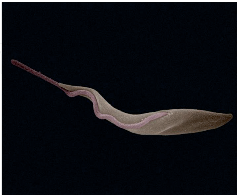
Figure 3. Trypanosoma brucei [48].

Human African trypanosomiasis (sleeping sickness) is caused by T. brucei infection ( Figure 3 ). T. brucei undergoes meiosis within the salivary glands of its tsetse fly vector. Meiosis appears to be a normal part of the developmental cycle of T. brucei [49–51]. Three proteins that are only known to express during meiosis, Dmc1, Mad1 and Hop1, are found to be expressed in the nucleus of a small fraction of dividing epimastigote trypanosomes in the salivary glands and nowhere else [51, 52]. Haploid gametes produced by meiosis can subsequently undergo pairwise interaction leading to cell fusion [49].