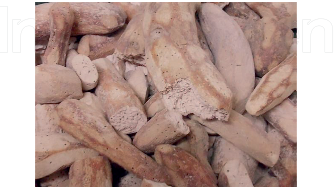
Figure 2. Yam chips infested by D. porcellus .