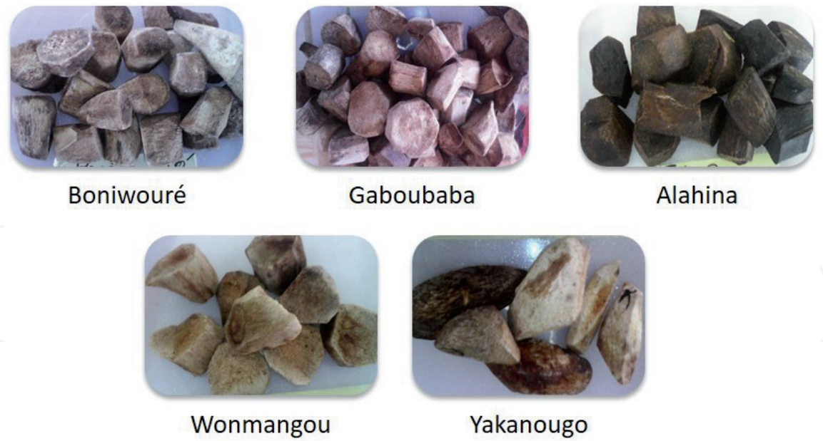
Figure 3. Pictures of chips from the five resistant landraces to D. porcellus identified by Loko et al. [16].