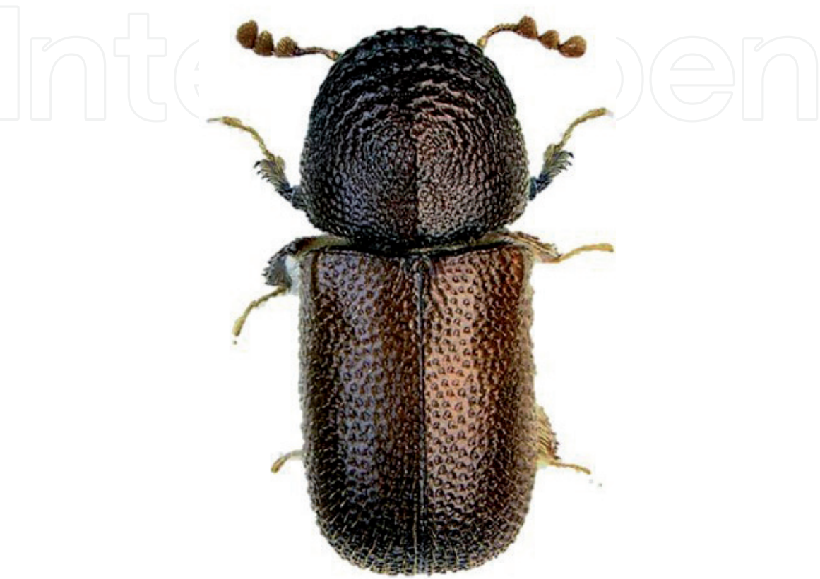
Figure 1. Dinoderus porcellus adult.

In West Africa, the beetle D. porcellus is a serious pest of stored chips of several roots and tubers such as cassava [21], yam [10], and cocoyam [22]. D. porcellus digs holes in the yam chips ( Figure 2 ), drastically reducing their internal parts into powdery waste, which negatively affects their visual quality and decreases their commercial value. Under laboratory conditions, the weight loss due to this pest in