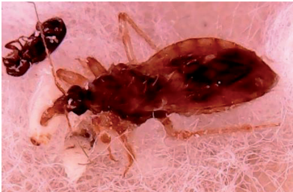
Figure 4. Predation by A. biannulipes adult on nymph of D. porcellus .

as Corcyra cephalonica (Stainton) (Lepidoptera: Pyralidae), Tribolium confusum du Val (Coleoptera: Tenebrionidae), and Anagasta kuehniella Zeller (Lepidoptera: Pyralidae) [36]. What could be affected is its effectiveness as a biological agent of D. porcellus in farmer storage conditions. Therefore, prior to the use of this predator in an IPM program against D. porcellus , it is important to do a molecular gut analysis for determining the part of D. porcellus in its diet. Moreover, it is important to evaluate the population dynamics of A. biannulipes and D. porcellus within multispecies and/or multitrophic systems.