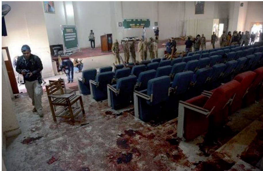
Figure 2. The Army Public School attack in 2014.

In 2019, during the celebration of Easter festival in Sri Lanka, three churches and three hotels were targeted by the terrorist. In the suicide bombings, approximately 258 people were died including 45 foreigners, while the number of injured people was around 500. As per the official agencies, the terrorist was Sri Lankan national and was associated with a local militant group ( Figures 3 and 4 ).