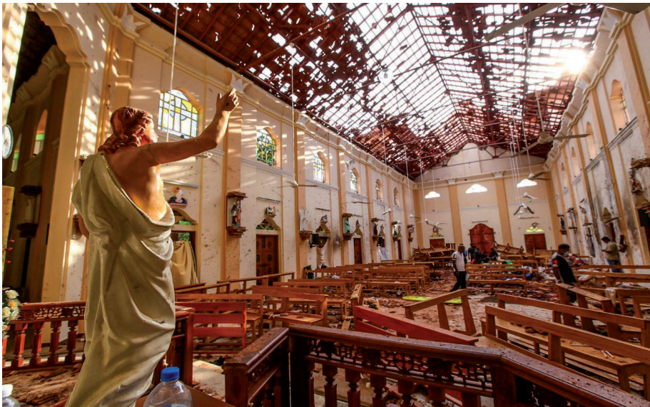
Figure 4. Suicide bombing on Easter day in Sri Lanka.