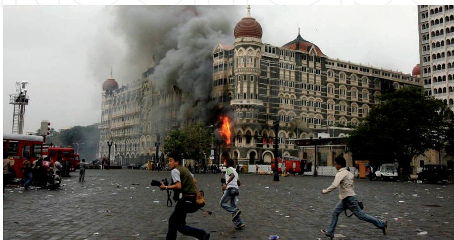
Figure 1. The Mumbai attack in 2008.

There is no doubt that there are many definitions of terrorism. Terrorism is a charged term. It is usually used with the connotation of something that is “ethically and morally wrong”. According to the Global Terrorism Database [1], from 2000 to 2014, almost 61,000 incidents of non-state terrorism, resulting in at least 140,000 deaths.