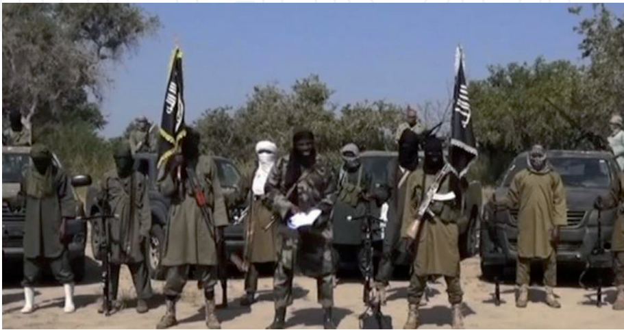
Figure 6. Boko Haram fighters in Nigeria.