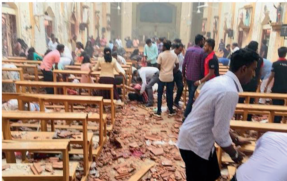
Figure 3. Attack on churches in Sri Lanka.

In February 2019, around 42 Indian soldiers have been killed in a suicide attack in the disputed area of Kashmir. After the suicide attack, the Indian government put