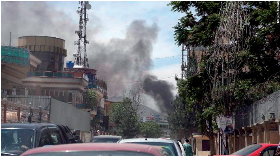
Figure 5. Smokes rises after a terrorist attack in Kabul.