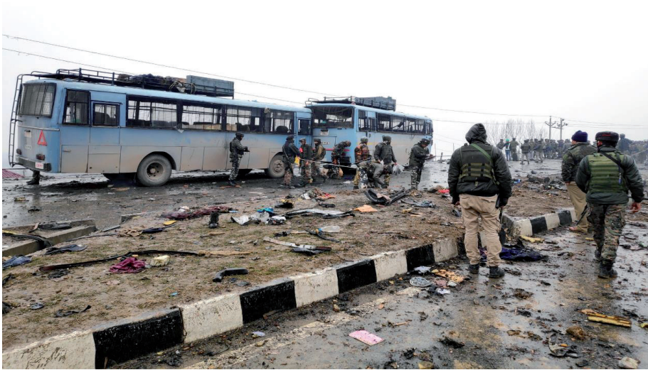
Figure 8. A suicide bombing last week in southern Kashmir killed at least 40 Indian soldiers.

their failure on Pakistani forces and blamed that the attackers were sent from Pakistan (Figures 7 and 8). On the other hand, Pakistani officials clearly denied the Indian officials statement. In addition, the Pakistani government spokesman said: “It is Indian habit to blame Pakistan.” Further, the spokesman offers that we are willing to investigate the case with the Indian government for better regional peace and prosperity.