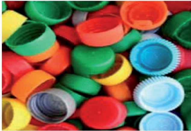
Figure 1. Counting manipulatives.