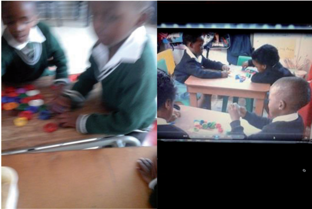
Figure 5. Students unstructured counting strategies.