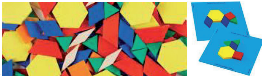
Figure 3. Shapes and pattern frames.