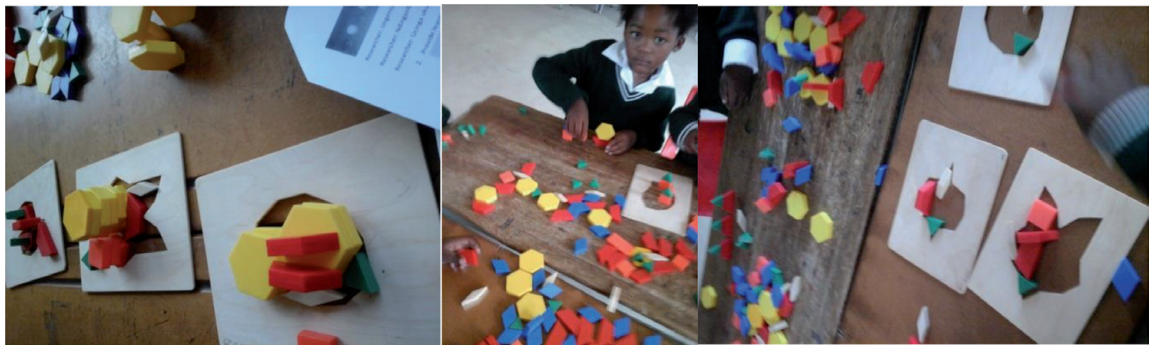
Figure 7. Students' piling of shapes.