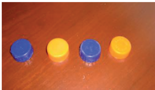
Figure 2. Pattern demonstration.