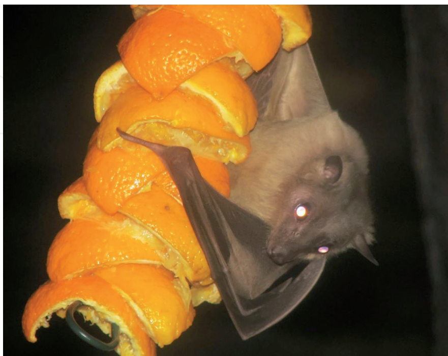
Figure 2. An Egyptian fruit bat ( Rousettus aegyptiacus ) clings to pieces of orange at the Cotswold Wildlife Park, England.