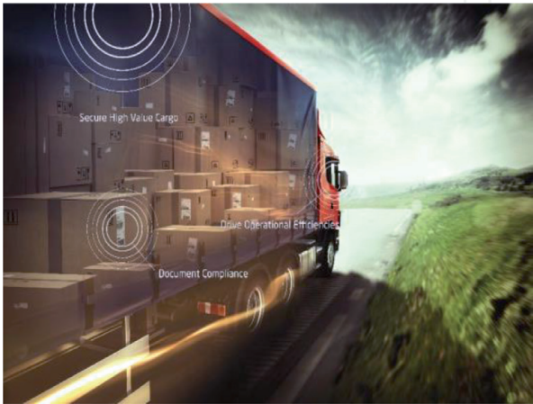
Figure 3. Systems of system.

What if we instead choose to fold in point solutions and targeted capabilities