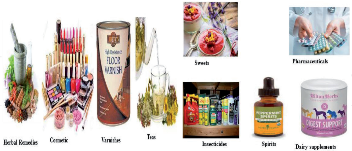
Figure 3. Modern trends of essential oils.

Essential oils are widely used in perfumes, personal hygiene products, and in aromatherapy including the inhalation, massage, masking agent to avoid the unpleasant odor in the textile industries, paint and plastic industries, and pharmaceuticals formulations. Essential oils are also used as the natural antifungal and antibacterial agents in the food safety items; essential oil also used in the various kinds of cereals, antimicrobial packing of the food items, edible thin film, nano-emulsion, preservation of the fruits and vegetables, soft drinks, as the flavoring agents in the carbonated drinks, as the major ingredients in soda/citrus concentrates, seafood preservations, fish, etc. ( Figure 3 ) [22].