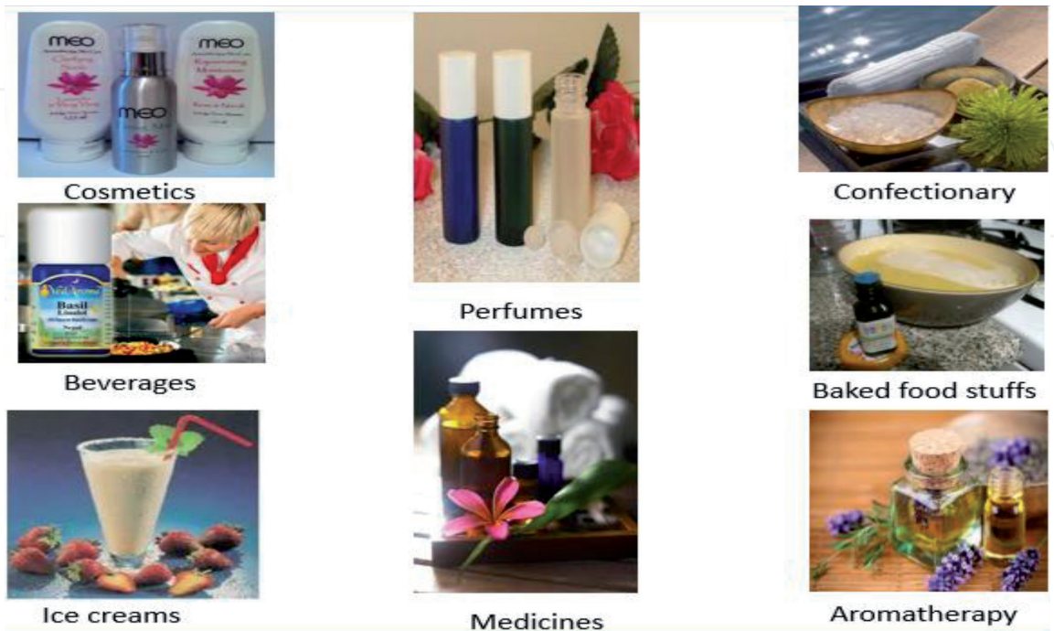
Figure 4. Applications of essential oils in daily life.

The essential oil of bergamot obtained from the peel of the fruits of the Citrus bergamia is known as the bitter orange tree. The extract of the bergamot is used in flavoring