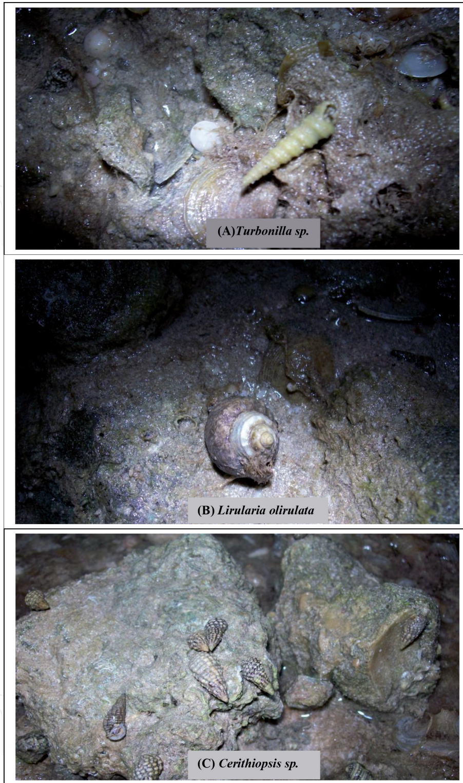
Figure 3. Samples of gastropods in their natural habitat during the lowest low tide.

In sampling locations partly submerged in water as in tidal pool [6, 12] coral reef habitat [13] and the littoral zone [14], water temperature was considered a moderating variable. Generally, the various habitats determined the species of gastropods [7] which directly or indirectly affected by the dynamics of the environmental temperatures. The distribution of organisms is non-homogeneous in the intertidal zone which changes based on the biotic and abiotic factors [12]. Species diversity is moderate ( 2 < H' < 4 ) among the Family Pyramidellidae ( H' = 3.29 ; J' = 2.99 ); Family Cerithiidae ( H' = 3.22 ; J' = 2.92 ); Family Oliveliidae ( H' = 3.12 ; J' = 2.84 ); Family Calliostomatidae and Turbinidae ( H' = 2.19 ; J' = 1.99 ) including species