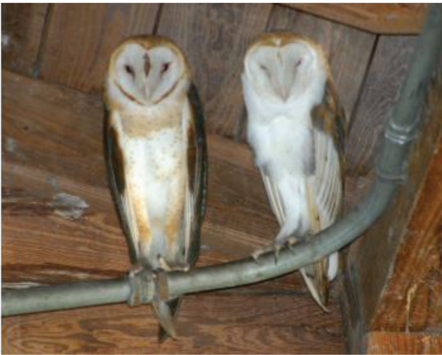
Figure 1. Barn owl: lighter colour male (right), female with spottiness (left). Credits: Jason Martin (Source: WEC [2]).

Some of the known and well-studied species of owls are the barn owls ( Tyto alba ), which are sometimes referred to as ghost owls or monkey-faced owls [2], Ural owls ( Strix uralensis ), spotted owls ( Strix occidentalis ) and tawny owls ( Strix aluco ). Barn owls are easily identified by a white or tan underside with black spottiness. The females tend to be darker than the males which are whiter [2]. However, the females