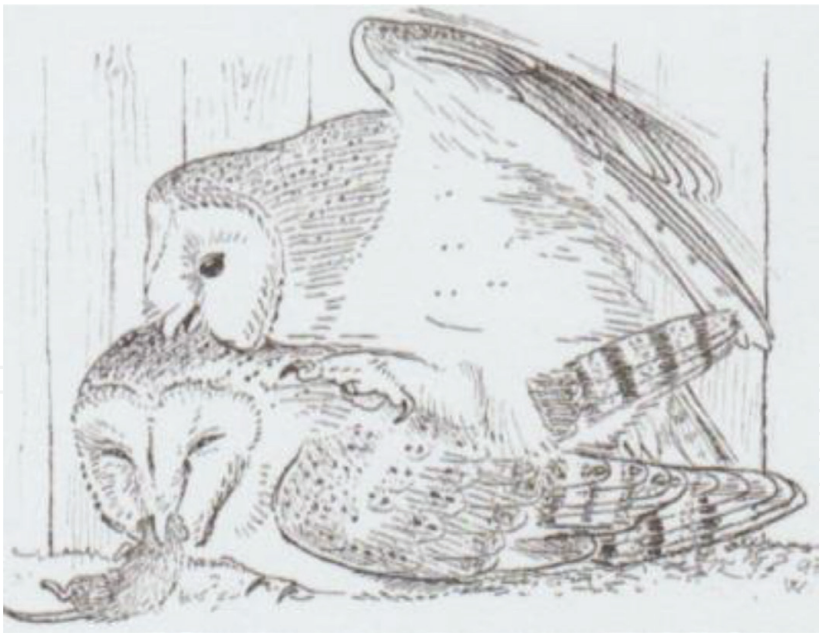
Figure 4. Copulation of owls, the female holding the male's gift in her bill. Source: König, Weick and Becking [10].

Copulation may follow once the female accepts the food ( Figure 3 ). In order to initiate breeding among owls, they call and sing. The song plays two important roles, which are for claiming the territory and to attract mates, although the male's song exercise reduces drastically after pairing [9, 10, 59]. Owls looking for mates may sing endlessly until a mate is found. The uniqueness of the female's song over the male's lies in higher pitch and clarity. Males of Tengmalm's owls ( Aegolius funereus ) are known to utter only a few phrases of song whenever they bring food for their mates [9, 10, 59]. Copulation among