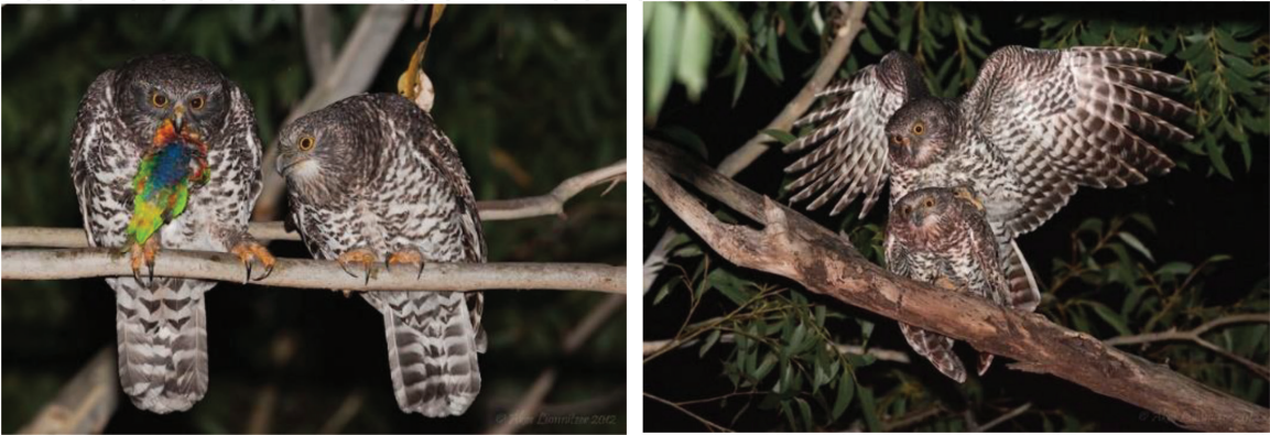
Figure 3. Owl pair courtship feeding and copulation, female is attracted by food (left); copulation followed acceptance of food (right). (Lewis [61]).

Courtship involves calling. The male calls to the female for attention, to attract the female to a suitable nest, although this may vary from one species to another. The calling may be accompanied with the provision of food, by displaying the prey animals.