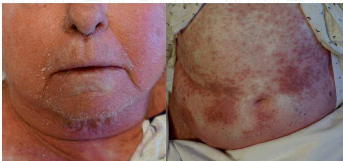
Figure 4. Typical appearance of staphylococcal scalded skin syndrome (SSSS). Left—face; right—abdomen.

Necrotizing fasciitis refers to the severe and rapid destruction of skin, subcutaneous fat, and muscle caused by bacterial infection (e.g., group A streptococci,