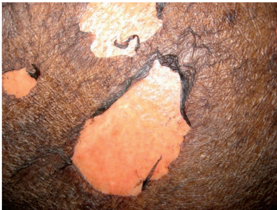
Figure 3. Typical appearance of toxic epidermal necrolysis (TEN).

TEN is a severe, life-threatening disorder (with a mortality rate approaching 40%) characterized by generalized loss of epidermis and mucosa ( Figure 3 ), typically involving more than 30% of the skin [215]. A tell-tale clinical finding that is almost always present in TEN is the phenomenon in which intact superficial epidermis can, via a pushing or shearing force, be dislodged and slid over underlying layers of skin; this indicates a plane of cleavage in the skin at the epidermal-dermal junction and is referred to as Nikolsky’s sign [216]. TEN is almost always medication-induced and involves a cytotoxic T-cell reaction with apoptosis of keratinocytes mediated by Fas ligand [217]. Consequently, the first step in treatment is similar to that of a burn injury—stop the underlying causative agent (i.e., discontinue all medications that are not essential). The next step is to confirm the diagnosis through a careful medication history and skin biopsy with frozen section. The finding of full-thickness epidermal involvement distinguishes TEN from other conditions such as staphylococcal scalded skin syndrome (see