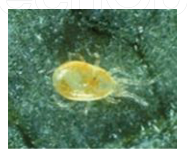
Figure 2. Neoseiulus fallacis.

Adults of N. fallacis are about 0.5 mm long, with pear-shaped bodies. These can vary in color from cream to orange-beige, shiny and semi-transparent, with long legs ( Figure 2 ). The immature stages are generally a semi-transparent cream color and difficult to see without a microscope. The eggs are oval, almost transparent, and 0.33 mm in diameter (double than size of a two-spotted spider mite egg). Adult females lay 1–5 eggs per day along the ribs on the undersides of leaves and a total of 26–60 eggs over their lifetime (which could be between 14 and 62 days) are laid. The eggs hatch in 2–3 days and newly hatched predators do not eat, but later stages and adults feed on all stages of prey. Generally, female A. fallacis can eat 2–16 spider mites per day. Of the five N. fallacis life stages, only the first nymphal stage is six legged, while all other post-egg stages have eight legs [44, 45].