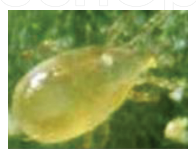
Figure 6. Amblyseius barkeri.

It is used against various thrips species and broad mite as well as other tarsonemid mites in greenhouses and indoor plantscapes. It works well on P. pallidus (cyclamen mite) and P. latus mites (broad mite, yellow tea mite and citrus silver mite). Mites pierce the instars of their prey and suck out the internal organs to eat, but do not eat adults. It is found as wild populations on cut flowers (orchids,