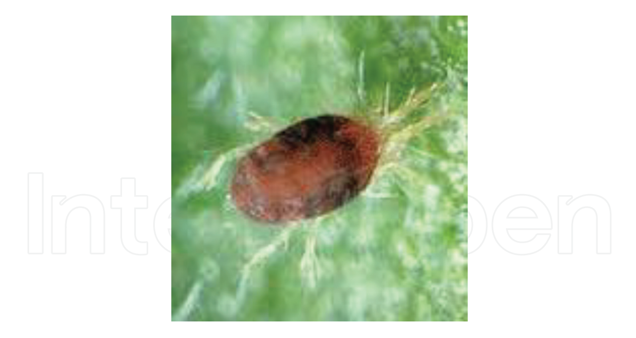
Figure 11. Tetranychus cinnabarinus.