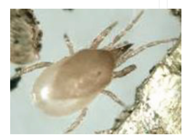
Figure 7. Amblyseius andersoni.

Predatory mite A. andersoni is a predator that forages on several kinds of tiny arthropods prey and pollen. It is broadly described as a predator of spider mites on fruit crops such as grapes, raspberries, peaches and apples, and many conifers. This predatory mite feeds on numerous diverse pest mites such as gall mite, russet mite and spider mite. Its foremost target pests are spider mites Tetranychus spp., ( T. urticae and T. cinnabarinus ), broad mite and cyclamen mite ( P. latus and P. pallidus ), European (or citrus) red mite ( Panonychus spp.), broad mites and Eriophyid mites including the tomato rust (or russet) mite Aculops lycopersici Massee (Eriophyidae). These mites can also survive on young larvae of thrips, flower pollen, sugary excretions from pests and fungi, and gall midges, so, these can be introduced before the prey is present. These feed on and control all stages of phytophagous mites with all mobile life stages of A. andersoni to forage on prey. It is an excellent choice for pre-emergent control of pest infestations because of their varied diet and ability