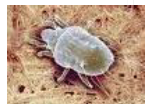
Figure 12. Tyrophagus putrescentiae.

Under optimum conditions, a generation can be completed in 8–21 days. As the temperature falls, the length of the life cycle increases greatly. This mite will tolerate high temperatures, and the larval stage is particularly susceptible to low and high