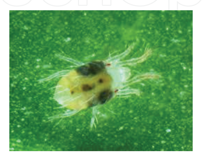
Figure 10. Tetranychus urticae.

If a female has mated, the fertilized eggs develop into both male and female mites, if not mated, the unfertilized eggs develop into males. Eggs are shiny spheres, clear to pale green in color, pearl-like and about 0.14 mm in diameter. Eggs are laid singularly, with females depositing 5–6 eggs per day, with a total of 60–100 eggs per female. Eggs hatch in 3–6 days depending on temperature. Eggs hatch into six-legged larvae, then progress through protonymph and deutonymph stages before becoming to adults. Larvae are about the same size as eggs and the only life stage with six legs (protonymphs, deutonymphs and adults are all eight-legged). The octopods deutonymph is generally larger than the protonymph, although similar in color pattern. Larvae and nymphs complete development in 4–9 days depending on temperature and the females have a pre-oviposition period of 1–2 days. Since generations overlap, all life stages can usually be found simultaneously. There can be nine or more generations per year and adults live about 30 days [104–106].