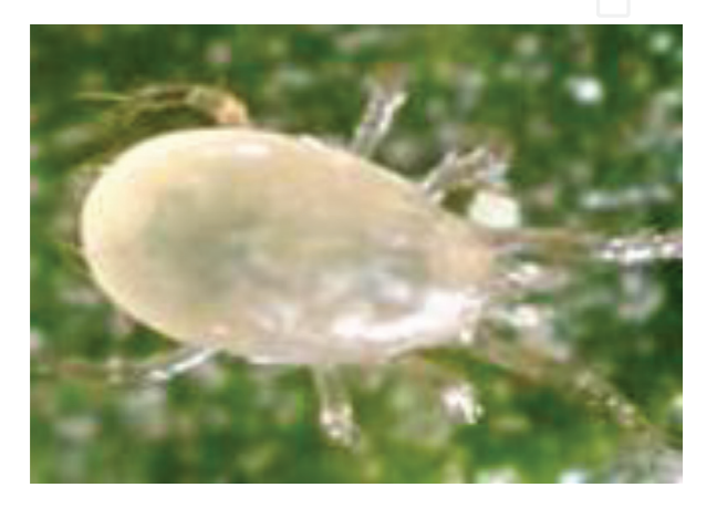
Figure 5. Amblyseius swirskii.

Species A. swirskii is commonly used to control whitefly and thrips in greenhouse vegetables (especially cucumber, pepper and eggplant) and some ornamental crops, and other pests on citrus and other subtropical crops. The mites are released directly in the crops in bran or vermiculite carriers sprinkled on the leaves or substrates, or may be broadcasted via air blast or other automated distribution technique. The recommended release rates are typically between 25 and 100 mites per m<sup>2</sup> depending on pest species, pest density and type of crop [70, 71].