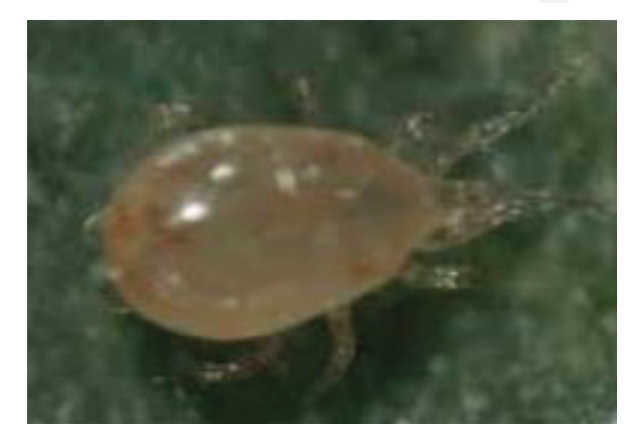
Figure 1. Neoseiulus cucumeris.

Cucumeris predatory mite Neoseiulus (= Amblyseius ) cucumeris (Oudemans) has a worldwide distribution because of its natural occurrence and commercial use in various parts of the ecosphere. Cucumeris is soft-bodied and translucent pale brown to sometimes tan-colored depending on the food consumed. These can be distinguished from most pest mites by their shape and mobility ( Figure 1 ). Cucumeris moves rapidly along the underside of leaves and in flowers of plants. Adult mite is pear-shaped and may range between 0.5 and 1.0 mm in length with long legs. Gnathosoma corniculi is slightly convergent distally, dorsal shield strongly reticulate with 17 pairs of setae, and sternal shield smooth with few lateral striae, three pairs of setae and two pairs of lyrifissures. Eggs are laid on the leaf surface, on domatia or on hairs (trichomes) along the midrib on the underside of leaves and occasionally on petiole hairs. The eggs are round, translucent white and measure 0.14 mm in diameter. Females lay 1–3 eggs per day for an average of 35 eggs over their lifetime. The eggs hatch in about 3 days later [35].