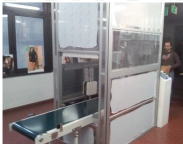
Figure 2. RFID tunnel with exchanging direction motor conveyor for warehouse entry and delivery exit.

The manufacturer can easily create his own mobile app or website where the final consumer can verify the authenticity of the product by entering the 22-character alphanumeric code of the RFID in a form made available by the manufacturer. By promoting this autonomous verification system by the final customer, a widespread control is carried out on the authenticity of the product without direct costs for the manufacturing company.