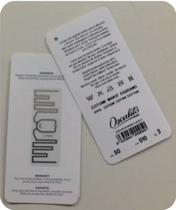
Figure 1. RFId Oscalito. Particular of the ‘maintenance’ card with RFId tag associated to the guarantee of Made in Italy product.

The implementation of RFID tags automatized all logistic functions, such as entrance into the warehouse with production notes and inventory functions by