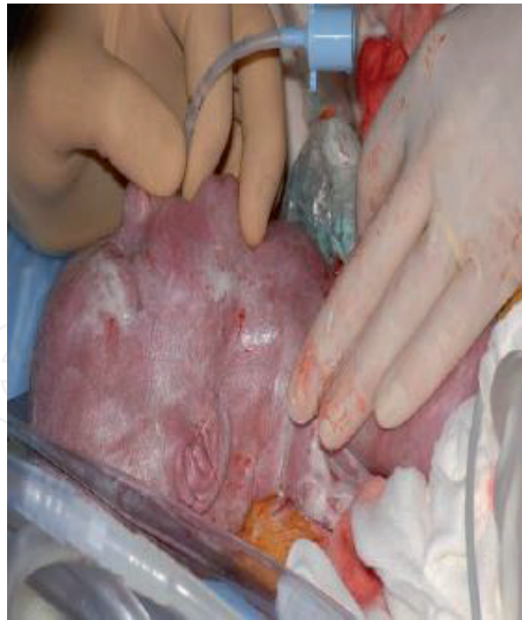
Figure 2. Successful oro-tracheal intubation during the EXIT procedure.

monitors, fetal airway establishment during surgical intervention then delivery was completed with, transition of the baby to postnatal care, and finally completion of cesarean section ( Figure 2 ) [30, 31].