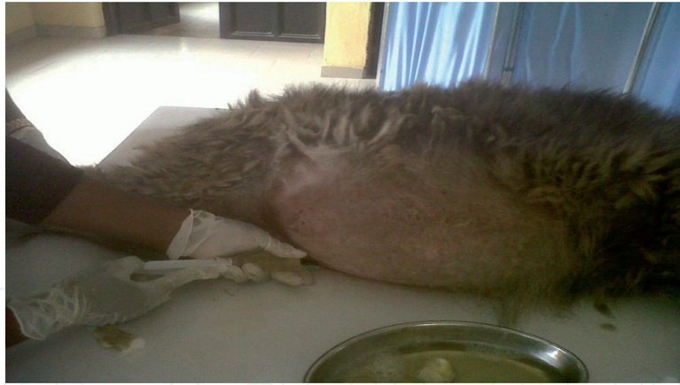
Figure 1. Removal of ascites through the linea alba in an Alsatian breed of dog.

condition. Auscultation of the heart reveals various cardiovascular diseases such as muffled heart sound which is consistent with pericardial effusion and cardiac tamponade. Heart murmurs or irregular heartbeats are suggestive of right-sided heart failure. An elevated heartbeat or tachypnoea may result from dyspnea due to cranial displacement of the diaphragm into the thoracic cavity. Cardiovascular abnormalities are confirmed through the use of electrocardiograph and echocardiography.