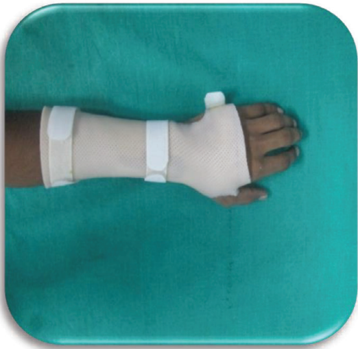
Figure 2. CTS dorsal splint.