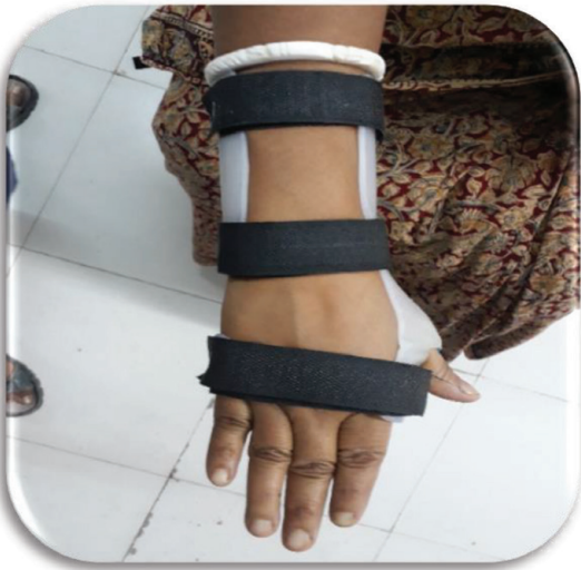
Figure 6. CTS thumb spica.