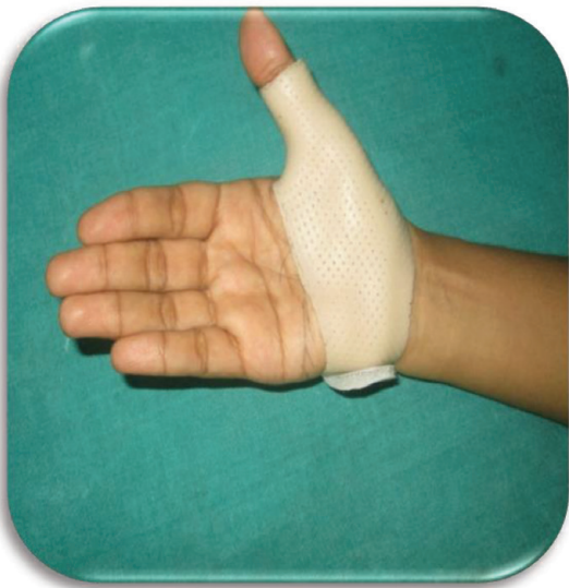
Figure 4. CTS carpal lock splint.