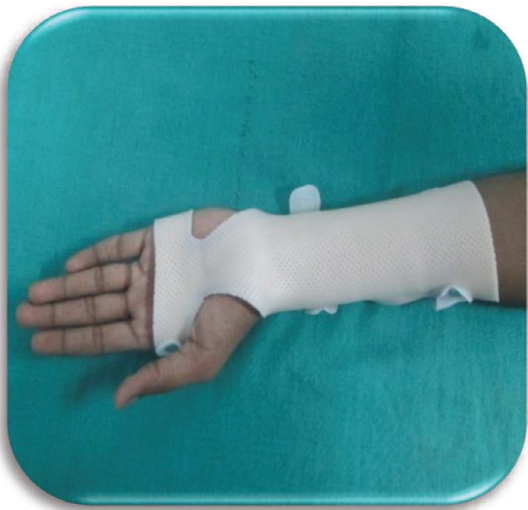
Figure 1. CTS volar splint.