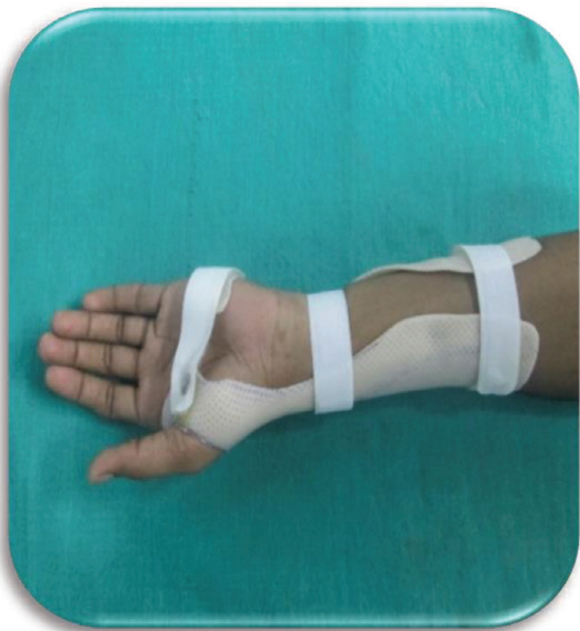
Figure 3. CTS wrist hand orthosis with thumb extension.