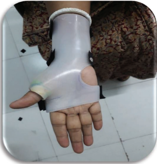
Figure 5. CTS thumb spica.