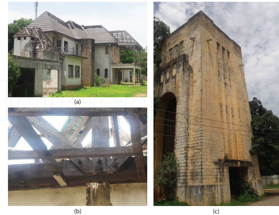
Figure 4. (a and b) Lord Frederick Lugard residence as you approach and the roof trusses showing well-seasoned timber bolted and secured for about a century. (c) Lord Frederick Lugard residence Water Tower often used as a watch tower during early days of Kaduna township development.