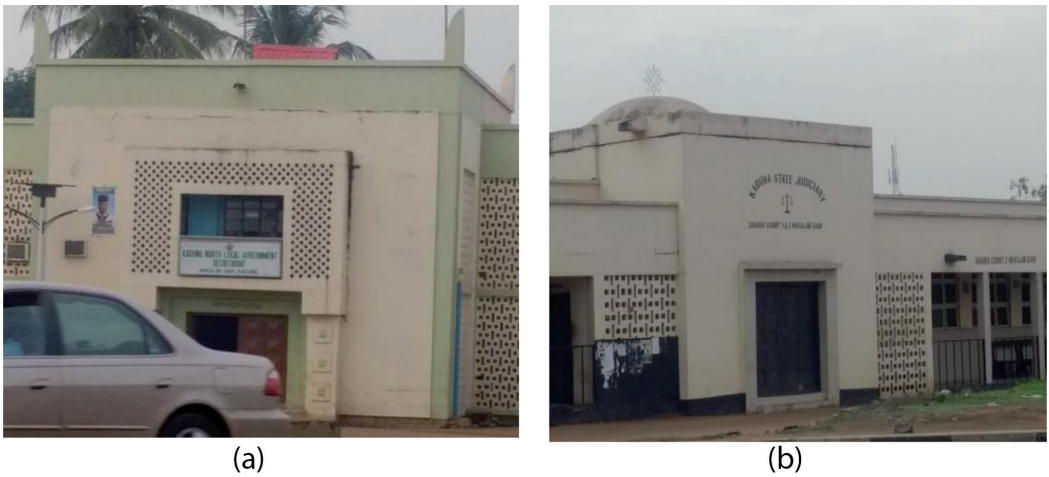
Figure 8. (a) The Kaduna North Local Government Area building and (b) Shariah Court of Appeal as part of Magajin Gari Native Authority Administrative building.

presently sited at the old Kaduna Garden now Hassan Katsina Park. Was re-erected in 1954 and has been there since then along the swimming pool road beside the old shooting range. Kaduna Railway Junction Steel Bridge , over river Kaduna, is linking the two parts of Kaduna metropolis (North and South). It is quite a unique view of excellent steel works on concrete columns running parallel to the main arterial road linking