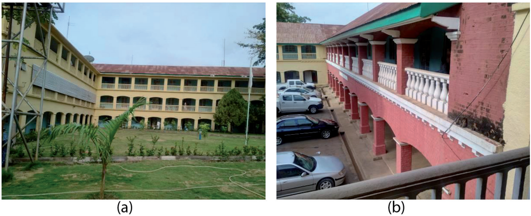
Figure 7. (a) Kaduna state Ministry of Health and Human Resource building and (b) Kaduna State Ministry of Women Affairs building at the foreground.