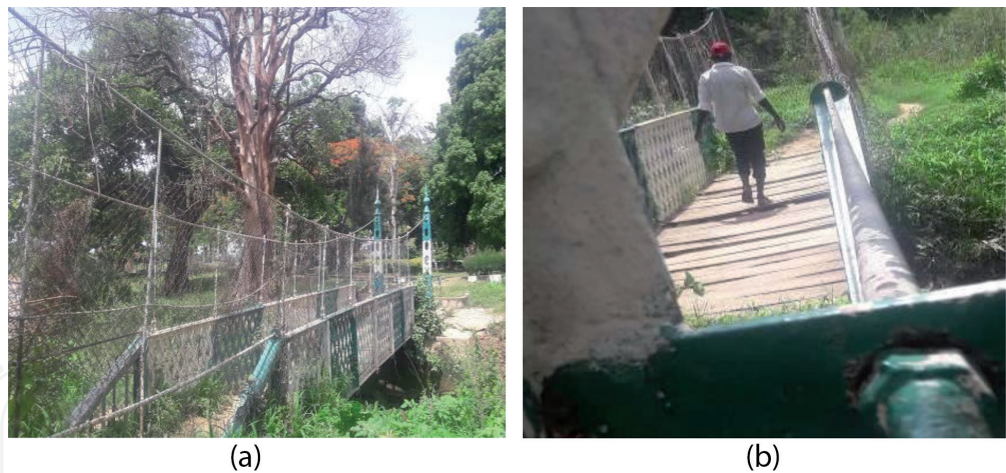
Figure 9. (a) Lord Lugard Bridge at Gamji Gate showing the steel frame across one of the streams to river Kaduna and (b) bridge showing the timber planks serving for foot passage.