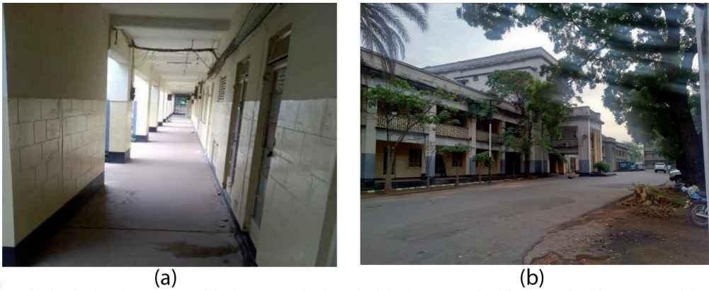
Figure 6. (a) Corridor along the Ministry of Water Resources and (b) Ministries of Justice at the background and Water Resources at the foreground in need of renovation.