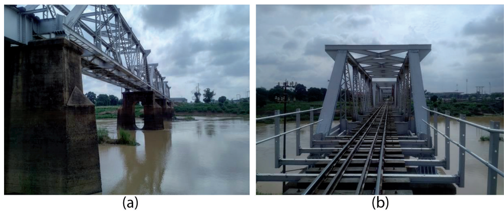
Figure 10. (a) Railway line bridge across river Kaduna and (b) intricate steel works carrying the rail line across river Kaduna.

the two parts of the city made up of concrete bridge as you journey daily from one end of town to the other ( Figure 10a and b ).