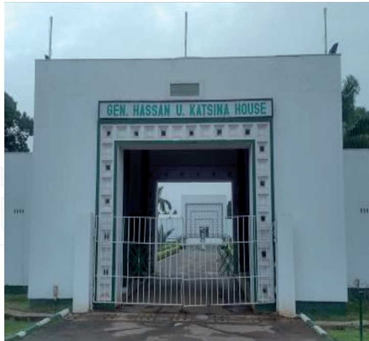
Figure 1. Hassan Katsina State House with banquet hall at the background.

complex as you enter the main gate is the banquet hall that serves as the state for major occasions ( Figure 1 ). Its design is an integration of the traditional Hausa Architecture and utilisation of colonial-styled materials and skill craftsmanship for its design and construction.