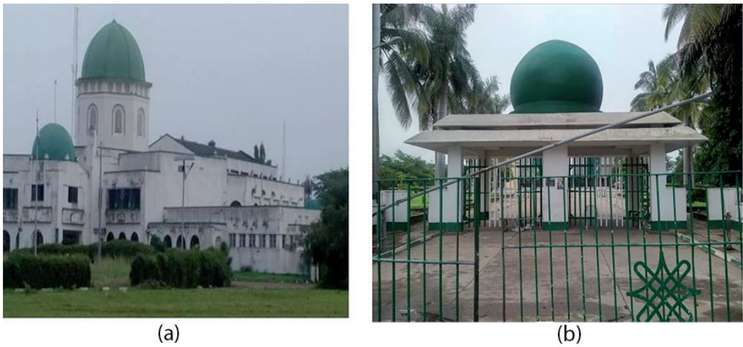
Figure 3. (a) Lugard Hall currently serving as Kaduna State legislative House of Assembly and (b) Lugard Hall entrance gate.

State Secretariat Complex along the Independence way is a collection of very interesting and unique colonial heritage buildings that housed the Civil Service Ministries then and now. The ministries currently being housed include Education, Economic Planning and Finance ( Figure 5a and b ). Figure 6 is showing the ministry of Justice and Ministry of Water Resources. Across the road directly opposite these ministerial complexes are two other ministries. They are the Ministry of Health and Women Affairs in Figure 7a and b . Most of the buildings have undergone some form of renovation, particularly the replacement of roofing structure and linings. The main building structure is still intact and wonderfully preserved in its initially built form.