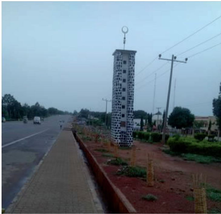
Figure 2. Kaduna Entrance Obelisk at old NDA Junction around Federal Court of Appeal.