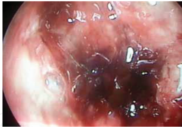
Figure 3. Endoscopic intraoperative view of static blood inside the lesion.

was carried out to remove the nasal swelling, which showed multiple cystic swellings that were filled with blood ( Figure 3 ), and tissue specimens were sent for histopathology. The histopathological specimens, on gross appearance, consist of friable hemorrhagic material that is often gritty. In en bloc resections, cyst and cortical destruction was appreciated. Microscopical results showed stroma composed of fibroblasts, multinucleate giant cells, and bone, as well as cystic spaces often filled with blood with an increased number of giant cells lining the cavity. The final histopathological diagnosis was ABC. The patient had smooth recovery postoperatively and was asymptomatic in 6 months of follow-up but unfortunately lost for subsequent follow-up after.