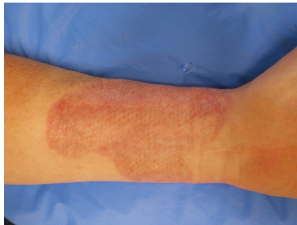
Figure 3. Meshed split skin graft to forearm 6 weeks post-grafting and demonstrating good healing.

been an early adopter of the multidisciplinary approach, with an emphasis on scar management by occupational therapists and physiotherapists, once wound healing has been achieved [17]. Scar modulation techniques include pressure garments, topical silicone materials, massage, moisturising and steroid injection and will be further discussed in this chapter.