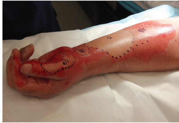
Figure 2. Illustrating burn depth: D is deep dermal, S/D superficial/deep junction. The S/D areas have a variable healing time that is dependent on patient and operative factors.