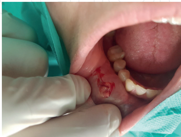
Figure 1. Linear incision and scalpel biopsy of labial salivary gland biopsy. A few labial salivary glands exposed and visible in the operating field.