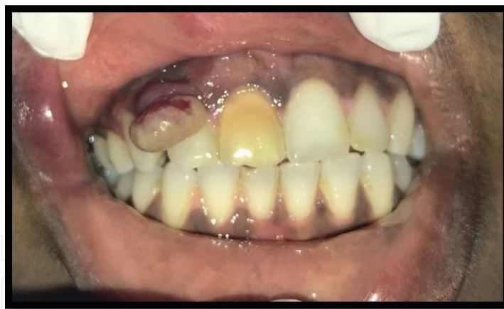
Figure 1. A case of pyogenic granuloma in maxillary right lateral incisor region in a 9-month pregnant woman.

The lesion frequently presents as a rapidly growing gingival mass that may bleed profusely when touched. Based on histological features, it is a highly proliferative vascular lesion resembling granulation tissue. The etiological triggers for pyogenic granuloma are unknown; most lesions are associated with the presence of local irritants or trauma [19]. The pathogenesis of the lesion has been linked to female sex hormones, which stimulate increased local synthesis of angiogenic factors such as vascular endothelial growth factor and angiopoietin-2 [8]. Clinical complaints with pregnancy-associated pyogenic granulomas include gingival bleeding, tenderness, and esthetic problems. Treatment may include surgical removal, especially if the lesion is large and symptomatic [19, 20]. However, in many cases, the lesions undergo partial or complete resolution after delivery, especially if local irritants are removed [8].