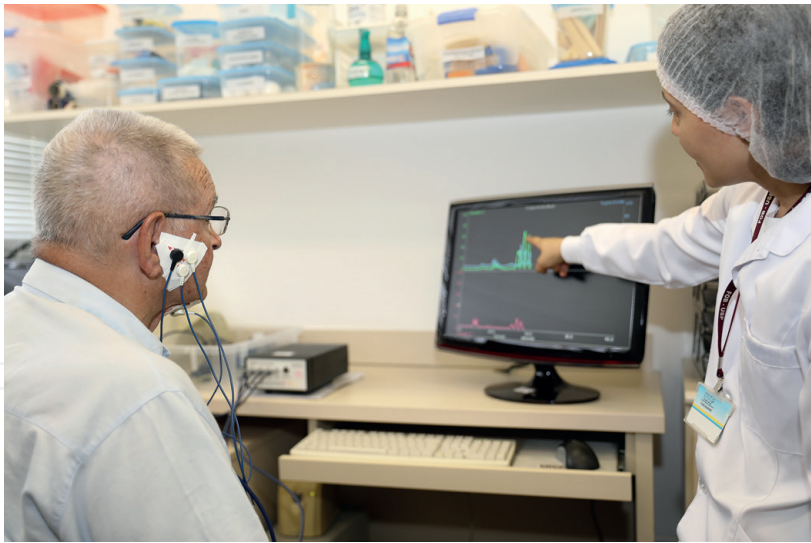
Figure 1. Patient and therapist during the direct training of swallowing, using the EMG biofeedback (4-channel neuroeducation equipment), monitoring the masseters, bilaterally, and suprahyoid muscles.