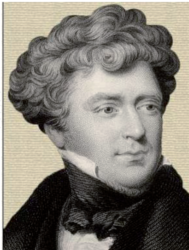
Dr. James Blundell

Because we know there are different blood groups today, doctors can save lives by transferring the right blood to patients. But previously, the blood transfusion was just a dream. This idea was first discussed by the doctors at the time of Renaissance. In later periods, a French doctor transfused calf blood to a patient in the 1600s and the patient died. Of course, blood transfusions which were made unaware of the presence of antigenic differences ended with death. Because of such unsuccessful trials, the blood transfusion gained a bad reputation. In 1817, Dr. James Blundell, an English obstetrician, said that living species had different blood structures, so blood could not be transfused between different species, but only human blood could be given to a human. In the following years, a total of 10 blood transfusions were performed, of which only 4 survived. Dr. Blundell did not know that human blood had different antigens, and people should be transfused with the same blood group antigens. And probably, this was the cause of death in some patients.