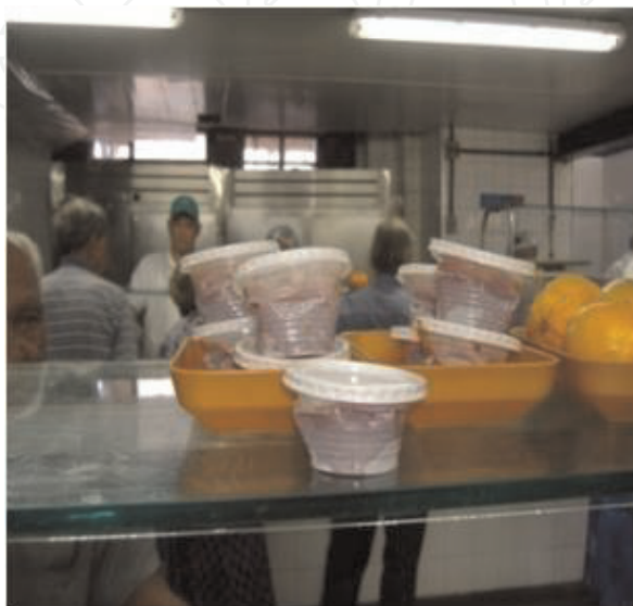
Figure 5. Lack of care with exposed meals.