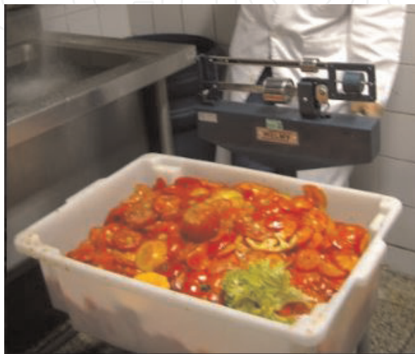
Figure 2. Direct weighing of solid waste generated during the production of meals.

For the analysis of organic solid waste, the total production of the preparations to be served at meals, the leftovers (prepared and undistributed preparations) and the food scraps (preparations distributed and not consumed by the diners) were weighed. From this analysis, the percentage of leftovers (Eq. (2)) and index of food scraps (Eq. (3)) were calculated.