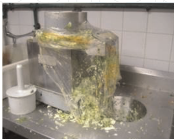
Figure 3. Food waste due to the lack of equipment maintenance.

Andreatti et al. [28] and Ricarte et al. [27] also established that food was wasted during the prepreparation of fruits and vegetables in the restaurants that they