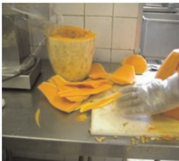
Figure 4. Excessive removal of edible food parts.

studied. The authors indicated that the waste was related to the failure to receive materials and the procedure adopted for cutting, which involved excessive removal of barks and shavings.