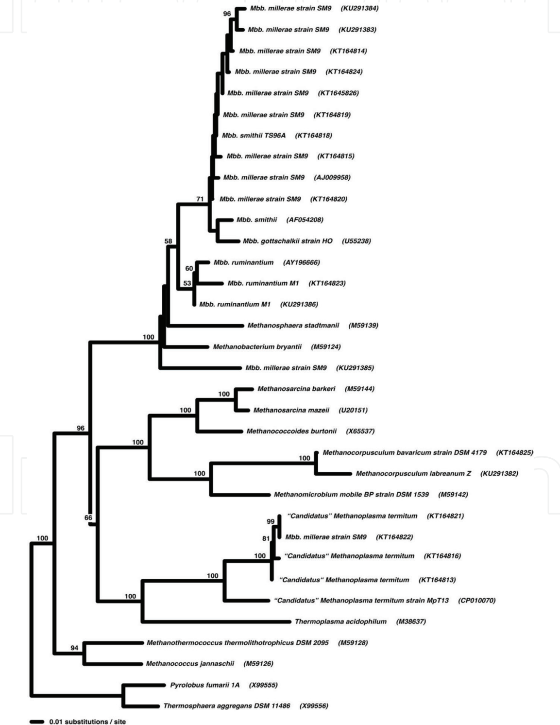
Figure 1. A phylogenetic tree based on 16S rRNA sequences obtained from camel foregut and reference sequences downloaded from NCBI Genbank database [58].

of Methanomicrobiales and Methanobacteriales along with total bacteria and that it remained constant for two animals using a particular diet [50]. Similarly, the ruminal diversity in Indian Murrah buffaloes by using amplified ribosomal DNA restriction analysis (ARDRA) maintained under standard diet of wheat straws revealed a total of 108 clones that were classified into 16 phylotypes. The 9 phylotypes showed less than 97% sequence similarity to any of the cultivated methanogen strain and represented a novel uncultured group of methanogens. The second group comprised of 4 phylotypes that showed 92–99% sequence similarity with M. mobile . The third group consisted of a single phylotype clustered with M. burtonii , reported for