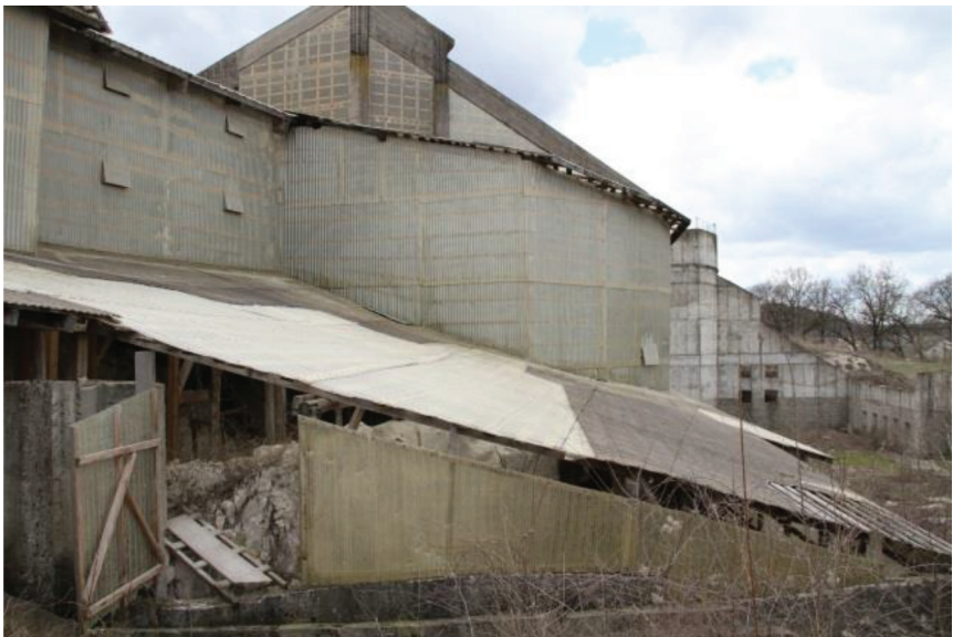
Figure 2. Provisional protection structure.