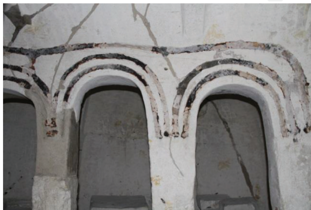
Figure 4. The photo of naos.

From the compositional point of view, the piece of chalk is a limestone, which is characterized as a biological clay, containing a multitude of limestone sediments, porous with small granularity and extremely fragile. The chalk sample has an organogenic chemical composition consisting of calcium vaterite and mineral clay, with a chemical formation comprising iron oxides and sediments. The wall is composed of calcium carbonate in a proportion of 90% and silicon dioxide [10]. In some places, there are traces of shells and shells of mollusks and ostracods, foraminifera, radiolar and diatomee, sponges of spongers and radiolarians, as well as crushed animal bones. Analysis of petrographic microscopy confirms that vaterite is generally unstable, except that it becomes stable below 10°C when the framboid is present inside the organic structure in the presence of CO 2 [11]. These framboid is in fact a conglomerate of smaller, especially spherical elements, having a dimension size varying between 36 and 150 nm [12, 13] ( Table 2 ).