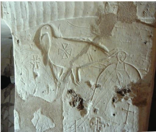
Figure 1. The interior of the churches and crosses, figures incised in the chalk wall.