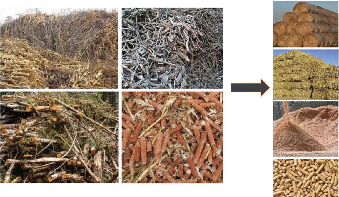
Figure 1. Increasing density of biomass.

Lignocellulosic biomass materials is mainly composed of three components which are lignin, cellulose, and hemicellulose ( Figure 2 ). These polymers are organized in complex non-uniform three-dimensional structures and each one has different polymerization degrees. Polymerization degree and/or structures of these biopolymers can vary among biomass species. Cellulose is a linear structure composed of \beta(1-4) linked glucose subunits. Cellulose molecules determine the cell wall