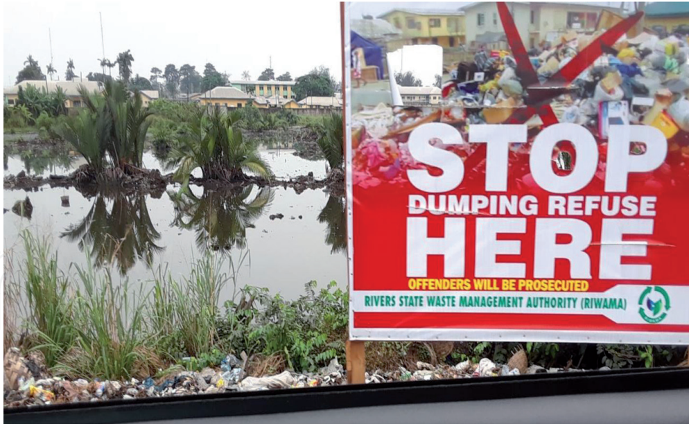
Figure 5. Enlightenment campaign against waste disposal in rivers and a mangrove forest at Eagle Island, Niger Delta, Nigeria.

proper city planning and employment of skilled waste managers, which go beyond what an individual can do. However, the government is well positioned to execute such gigantic projects. For government to acquire land and to use the state's resources to establish waste facility will not be a problem as compared to what an individual will do. For example, because of the land use system, land acquisition by a private person is more cumbersome and costly than when done by the state government.