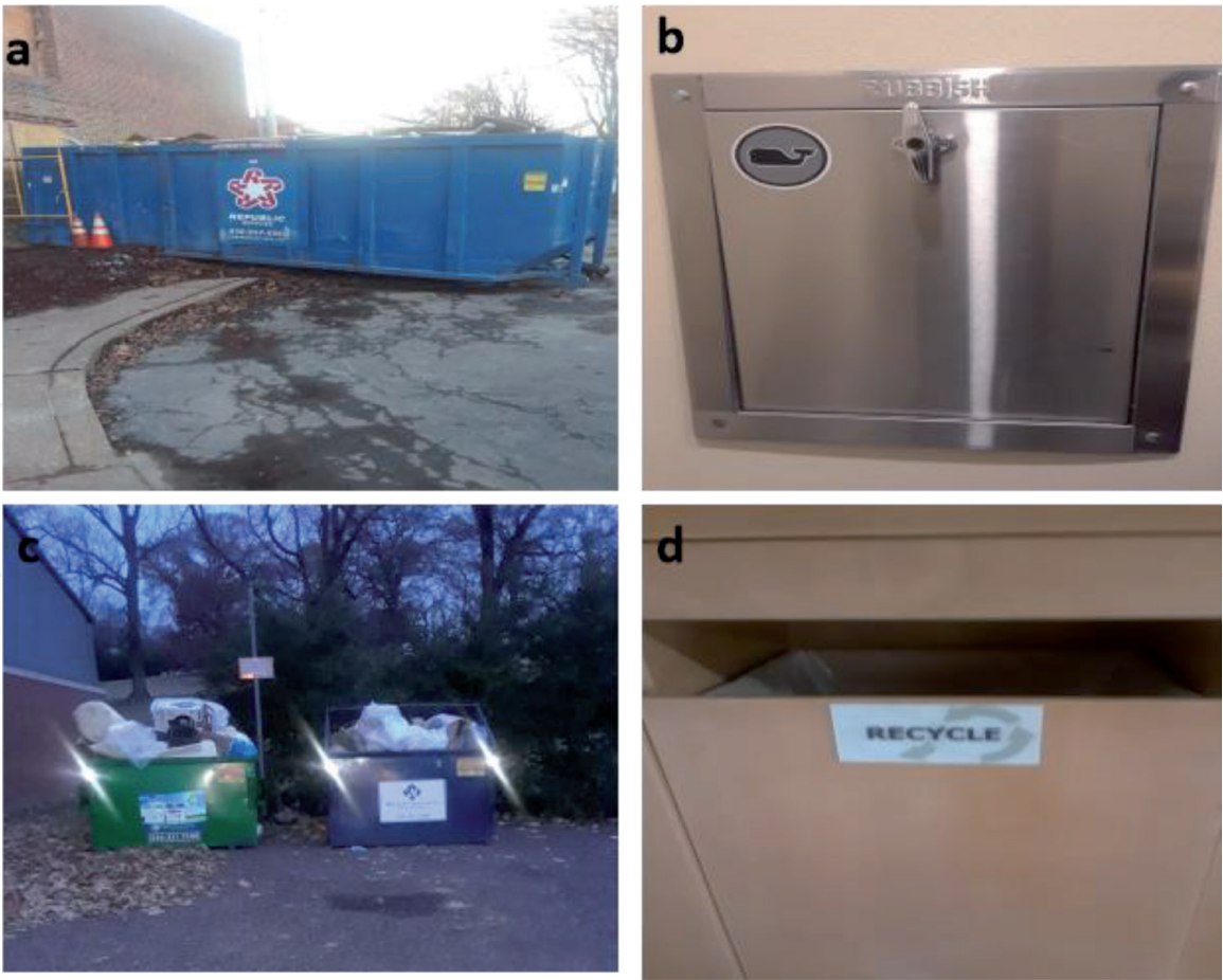
Figure 3. (a) Giant silo bin used to collect and convey building waste at a building renovation site. (b) Indoor waste disposal unit installed in a room to collect house hold waste, which will be channeled out into a silo bin placed outside for onward collection and disposal by waste agent at a building facility in Saint Louis USA. (c) Type I (rubbish, e.g., paper) waste collected and sorted for recycling (green silo).

There is no waste sorting culture in the region, which creates problem in the effective management of waste. This is because collected waste at different sites are all mixed up at home by residents and dumped by the road side for collectors to pick. There is no separation of waste into different types as practiced in developed societies ( Figure 3a, c ). Lack of waste separation creates problem for collectors who do not have the training or the equipment for separating the waste into its parts before final disposal in landfills [18]. Gross ignorance and helplessness in waste management had made a lot of people to become waste distributors, who pass on waste from one place to another in the name of management. They do this by pouring waste in restricted places under the cover of darkness or sometimes in the open without being confronted. Favorite areas of waste disposal in some cities in the