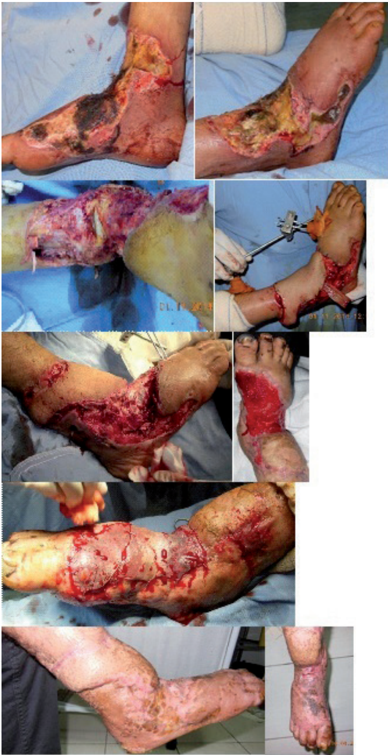
Figure 5. High voltage electric burn. Excision 7 days after burn with osteoarticular exposition. Use of sural flap, vacuum-assisted closure therapy and skin grafting.

The healing time does not depend on the total burn surface area (TBSA) or the healing modality (second intention or first intention). In our practice, it was found that, first, most patients who had flap cover healed beyond 1 month, and second, the flap cover in electrical burns, and despite its efficient functional and esthetic results, it prolongs the healing time. This is largely related to the severity of the initial lesions, lesions localization (joints and periorificial area), terrain, and infectious complications [7].