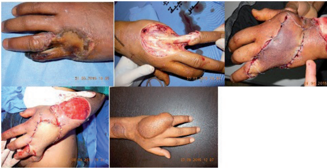
Figure 3. Low voltage electric burn. Necrosis of the fifth finger. Excision 6 days after burn. Immediate coverage by local flap. Partial necrosis of the flap. Groin flap.