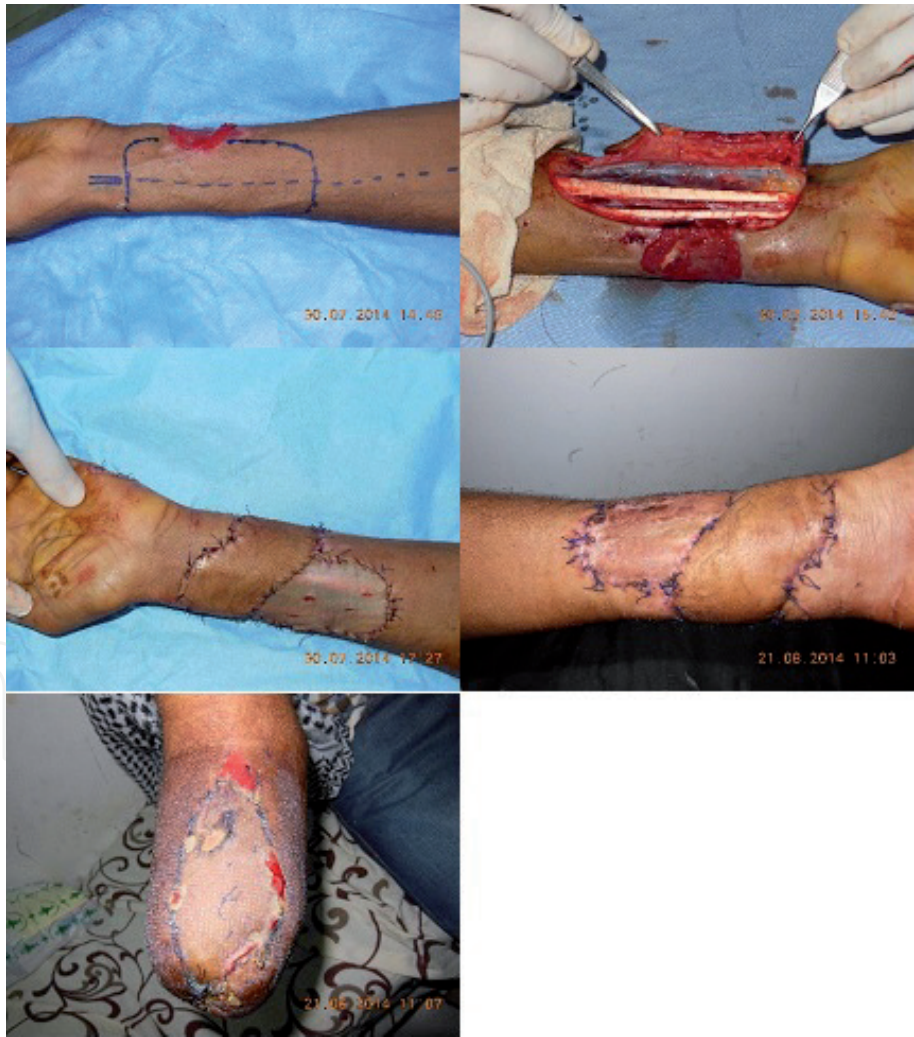
Figure 4. High voltage electric burn. Radial artery perforator flap for the left upper limb. Right upper limb amputation.

reduce the frequency of dressing changes and the exposure time. The application of a VAC system requires that the debridement phase should be completed. It accelerates the granulation phase and shortens the duration of hospitalization. In addition, we preserve this technique with deep and small skin defects ( Figure 5 ).