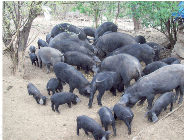
Figure 2. Moravka sows with piglets.