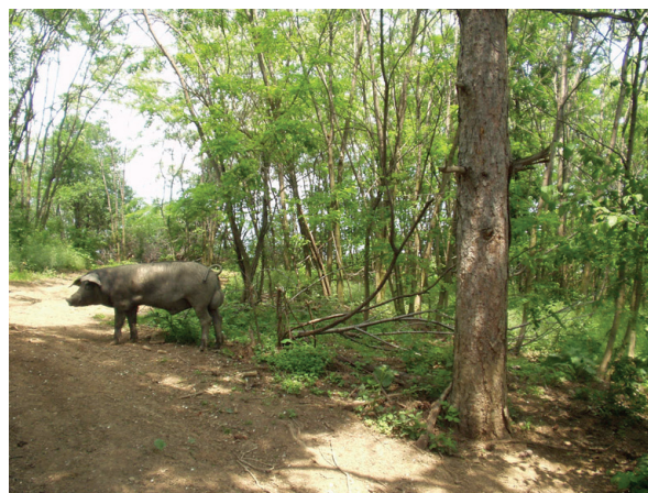
Figure 3. Moravka boar.