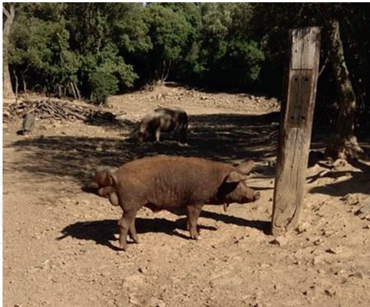
Figure 3. Sarda boar.

control or fences with frequent exchanges between wild boars and domestic pigs. This is one of the reasons of the difficult eradication of the African swine fever (ASF) disease as reported by Jurado et al. [7]. Animals often graze on public lands, with minimal recourse to shelters consisting of hollow trunks or shelters (in wood and/or stone). Animals are fed mainly on the natural resources of the oak and chestnut woods where they graze freely; the integration is minimal and commonly consists of cereals (flour or grain) or legumes, offered during periods of food shortage. With this production system, the animals remain in the herd during more than 1 year and they are slaughtered quite old. It is thus common to simultaneously have young pigs, middle aged pigs, and old animals (up to 3 years of age and more than 100 kg). Furthermore, seasonality of the events (births and slaughters) is a common management practice in Sarda breed. Animals are accustomed by the farmers to respond to their voice calls at pre-established points, where they receive the daily amount of food, directly offered on the ground [8].