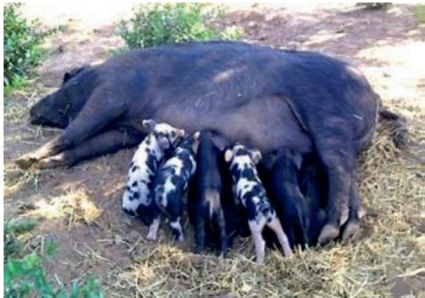
Figure 2. Sarda sow with piglets.

The Sarda is a small size breed with black, grey, tawny or spotted coat colour ( Figures 2 and 3 ). The bristles are numerous, long and rough, and on the dorsal line, they make up a mane. A lumbar tuft is possible. The head is of medium development, cone-shaped with a straight profile, small ears kept high up or leaning on the side. Wattles are sometimes present. Long tail with bristles sometimes forms a characteristic “horse” tail. Even if the breed presents large phenotypic variability, some morphological traits are considered indicators of crossbreeding and are thus cause of exclusion from the registry: absence of bristles, totally depigmented skin, straight ears, concave profile, striated cloak or agouti, presence of white band, even partial, on the chest. Sows of Sarda breed have on average 12.7 teats.