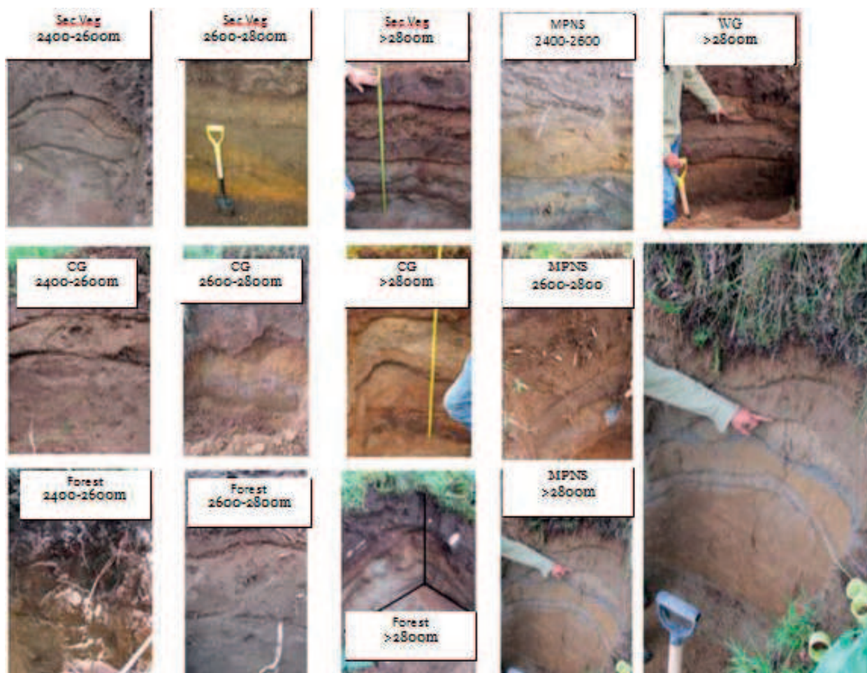
Figure 1. Mosaic of soil profiles in pits for different cover systems and at different altitude ranges in volcanic soils in Colombia (secondary vegetation; pasture mosaic with natural spaces; weeds; weedy grasses; clean pastures; and high, dense forest mainland).