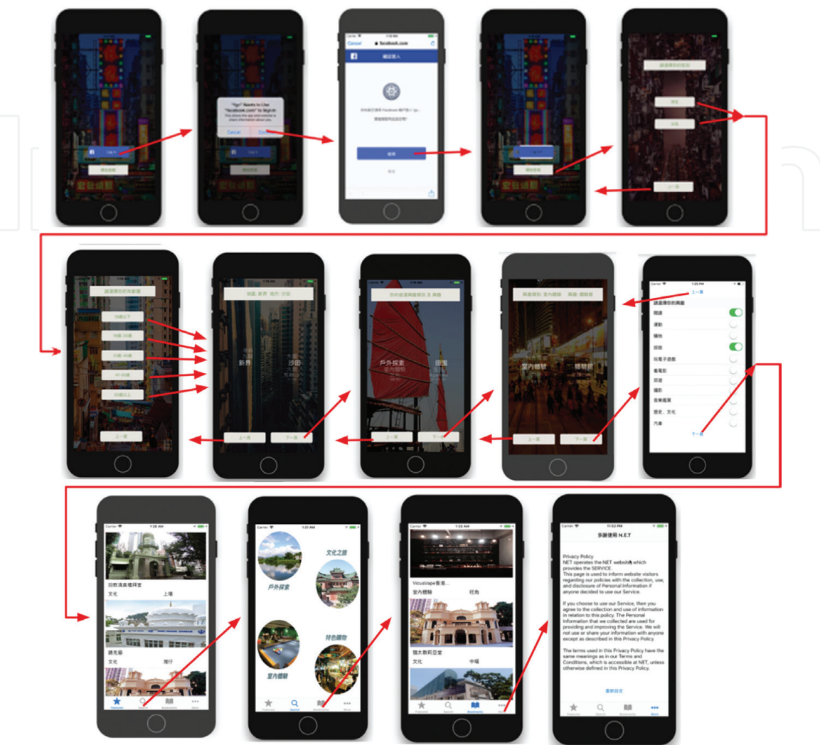
Figure 2. iOS application wireframing.

preference, second preference, and personal interest), which contribute to the result of the analytical model. After loading, the model will recommend some activities for the tourist based on their values on the tab “Featured.” On the tab “Explore,” a tourist