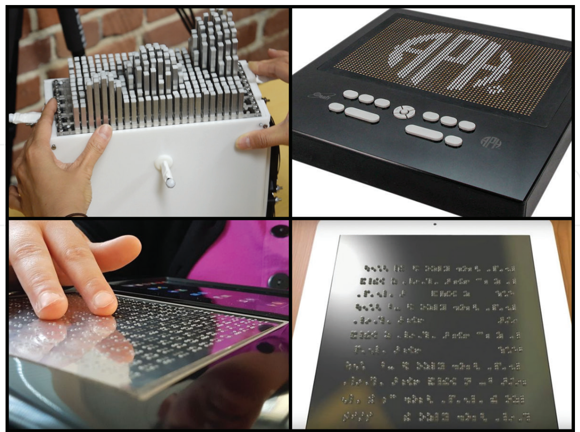
Figure 2. New innovative solutions being developed for individuals with BVI: upper left—demonstration of shapeShift (multi-height pin array) [39]; upper right—Graphiti (refreshable pin array) [37]; lower left—BLITAB (refreshable pin tablet) [38]; and lower right—Holy Braille (microfluidic tablet) [40].

While the above innovative approaches have various benefits, we posit that a more broadly adoptable solution is to use technology that: (1) provides direct perceptual access to the graphical content, as is the case via visual access, (2) is (or could be) mass marketed and readily available among end users, and (3) is based on a computational platform that can be leveraged for other functions/activities. We argue that this is best accomplished using dynamic touch-based (or multimodal) displays implemented on smart devices (phones/tablets). We believe that interfaces leveraging direct touch access are critical in solving the graphical access problem as touch has much in common with visual spatial perception, sharing many parallels with the visual pathways in the brain (e.g., [41, 42]). For example, both modalities extract the basic features and spatiality of an object in the environment and integrate this information to form a complete, coherent representation of the object