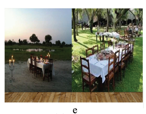
Figure 2. (a) Round huts built with modern materials, (b) grass thatched huts for a lodge, (c) a view from the inside modern hut, (d) how some of the lodges are advertised, and (e) the ambience and outdoor set-ups of the lodges.

But for Zimbabwe, while van den Bersselaar's [6] views are valid, even in historic Zimbabwe, the land reform program further redefined and created more opportunities for a greater percentage of the population to migrate to the city mostly for economic opportunities. In some cases, there is a total disconnection of some Zimbabweans from their rural homes especially under circumstances where none of their parents are surviving who in most cases are the elderly who may have retired to their rural homes. Hence, visiting newly created villages in the cities is thus in some cases symbolic journeys to their villages as well as their past. Further engaging the above, Saidi [30] observed that,