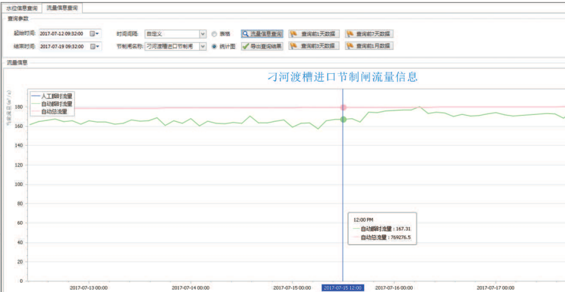
Figure 3. Flow data query interface for check gate in Diaohu River.