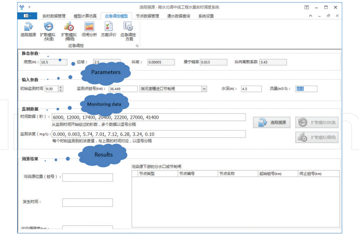
Figure 4. Traceability interface.