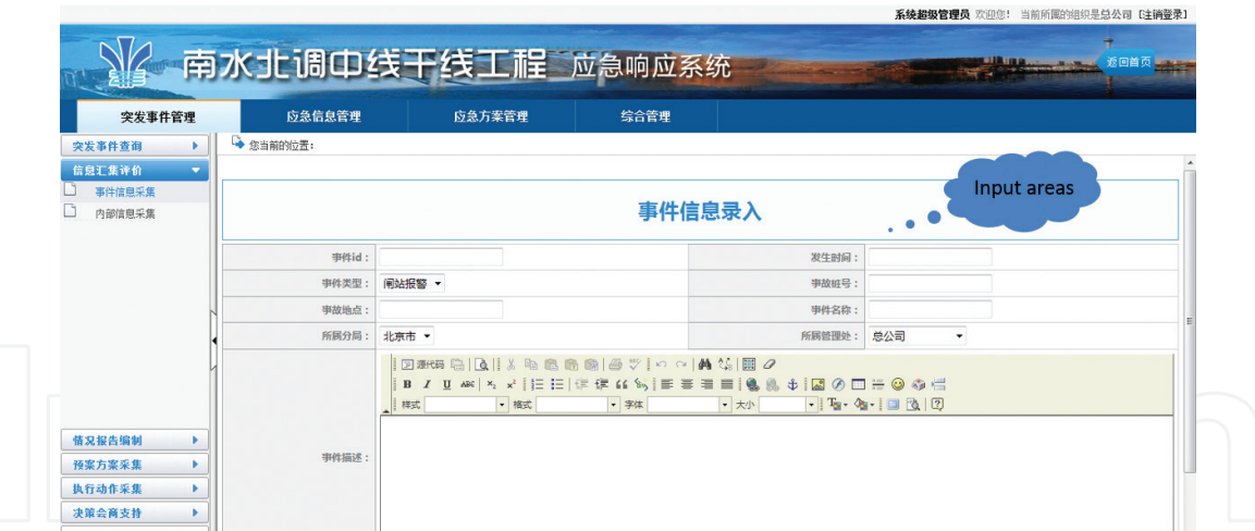
Figure 6. Event information input interface.