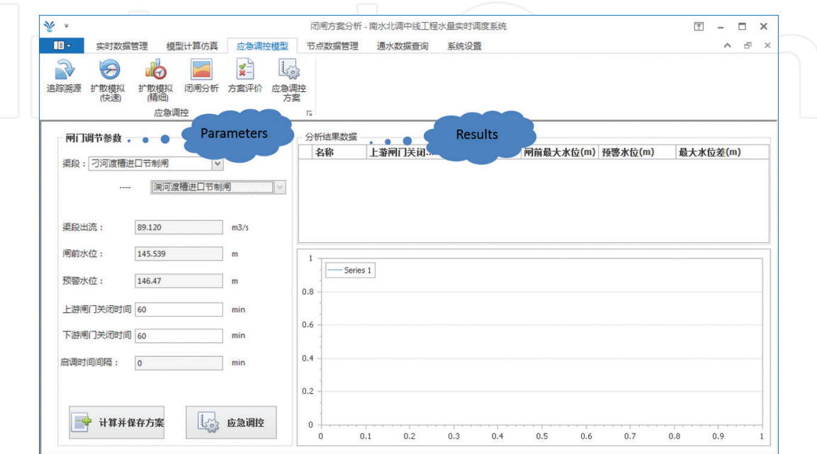
Figure 5. Interface of Emergency operation Plan.

The module function interface is displayed by taking the emergency operation plan setting interface (Figure 5) for example: