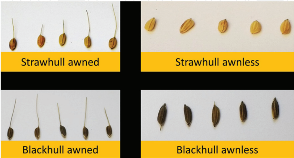
Figure 2. Weedy rice of different hull color and awn length collected from various rice fields of Arkansas, USA, in 2008–2009.

Morphological diversity in weedy rice can be attributed to its high genetic diversity. The genetic diversity of rice has been estimated using various markers like random amplified polymorphic DNA (RAPD), restriction fragment length polymorphism (RFLP), amplified fragment length polymorphism (AFLP), and simple sequence repeats (SSR) [50–54]. Of these SSR markers are most commonly