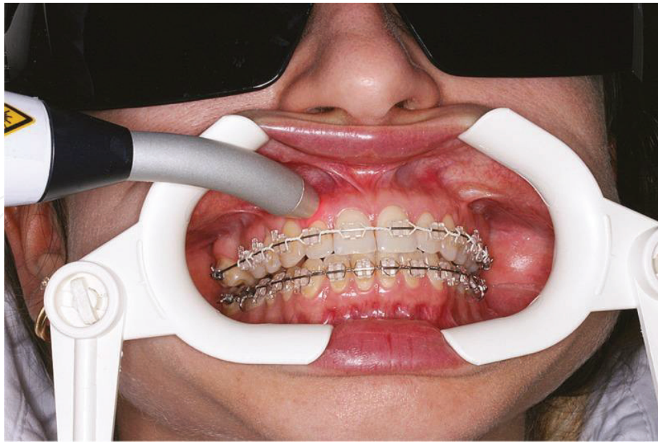
Figure 4. Low-level laser therapy.

Apart from physical agents, low-intensity pulsed ultrasound (LIPUS) has also been suggested. It uses mechanical energy which passes through the tissues as acoustic pressure waves [44]. This leads to biochemical changes at molecular and cellular levels. It can increase the healing of both soft tissue and hard tissue [45]. LIPUS is usually used at frequency pulses of 1.5 MHz with 200 \mu s pulse width, which is repeated at 1KHz a for 20 minutes a day with an intensity of 30 mW/cm 2 [46].