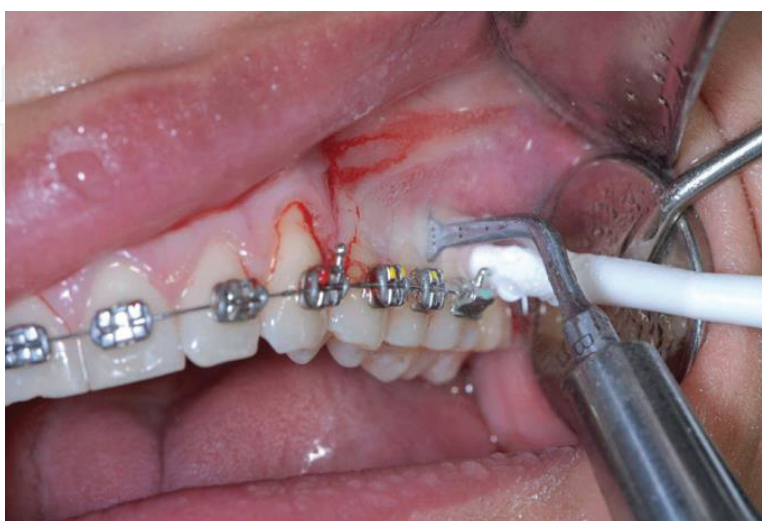
Figure 2. Piezocision.

Since the corticotomy procedure is still invasive, Dibart et al. introduced a new minimally invasive method called piezocision. Piezocision involves microincisions which are confined to the buccal side that allows the use of piezoelectric knife and selective tunnelling which enables hard and soft tissue grafting [25]. Piezocision is usually done a week after orthodontic appliance placement. The procedure involves vertical incisions made buccally and interproximally. The mid portion of the incision between the roots enables the piezoelectric knife to be inserted. A piezotome is then inserted in the gingival openings that were made and piezoelectrical corticotomy of 3 mm is made. Hard or soft tissue grafts can then be added via a tunnelling procedure ( Figure 2 ) [26].