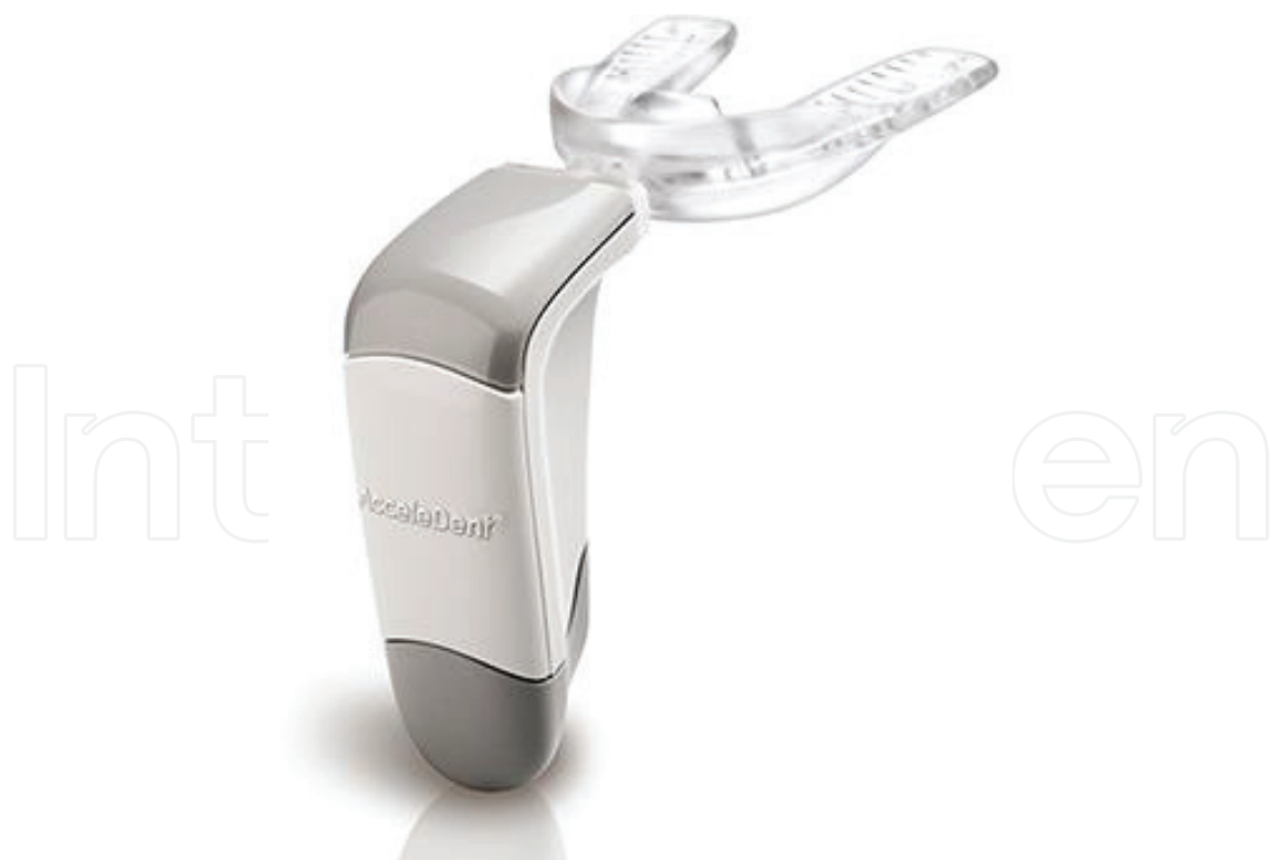
Figure 3. AcceleDent device.

Studies done by Fujita et al. and Yamaguchi et al. showed that LLLT enhances osteoclastogenesis on the compressed side of teeth being moved. There was stimulation of RANKL and macrophage colony-stimulating factor [39, 40]. Coordination of bone remodelling had been facilitated by RANKL and osteoprotegerin following orthodontic force with LLLT. LLLT stimulates bone formation on the tension side [41]. Kim et al. observed osteopontin localisation in the periodontal tissue in their study subjects, indicating LLLT may stimulate osteogenesis as well in orthodontic treatment [42]. Although much findings show LLLT stimulates osteoblast and osteoclast function, further studies are still required to optimise the effect of LLLT on tooth movement ( Figure 4 ) [43].