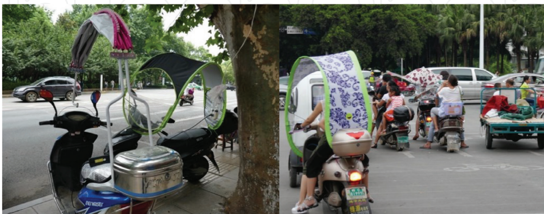
Figure 1. Guilin, China: both conventional and electric motorcycles are used.

In Europe, most e-bikes are of the bicycle style. Weather is less of a barrier to cycling compared to Asian countries; however, e-bike extends the range of trips that can be covered by