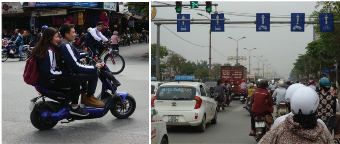
Figure 2. Hanoi, Vietnam: two-wheelers in mixed traffic, although on some roads space is allocated by mode.