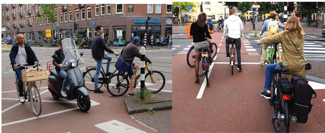
Figure 3. Amsterdam, the Netherlands: bike lanes are used by bicycles, mopeds and electric bikes.

bicycle, in distance and user groups. Looking at the Netherlands, e-bikes sales are increasing rapidly and in 2017 account for about one-third of bicycle sales [24]. Although in the early days of e-bikes it was mostly the elderly buying E2W, in recent years, its popularity is spreading to many other groups, including students, commuters and parents of young children. Approximately half of the km travelled is for recreational purposes [24]. E-bikes, just as mopeds, are allowed on the bicycle lanes ( Figure 3 ); however, as of July 2018, speed pedelecs need to use the main road in urban areas.