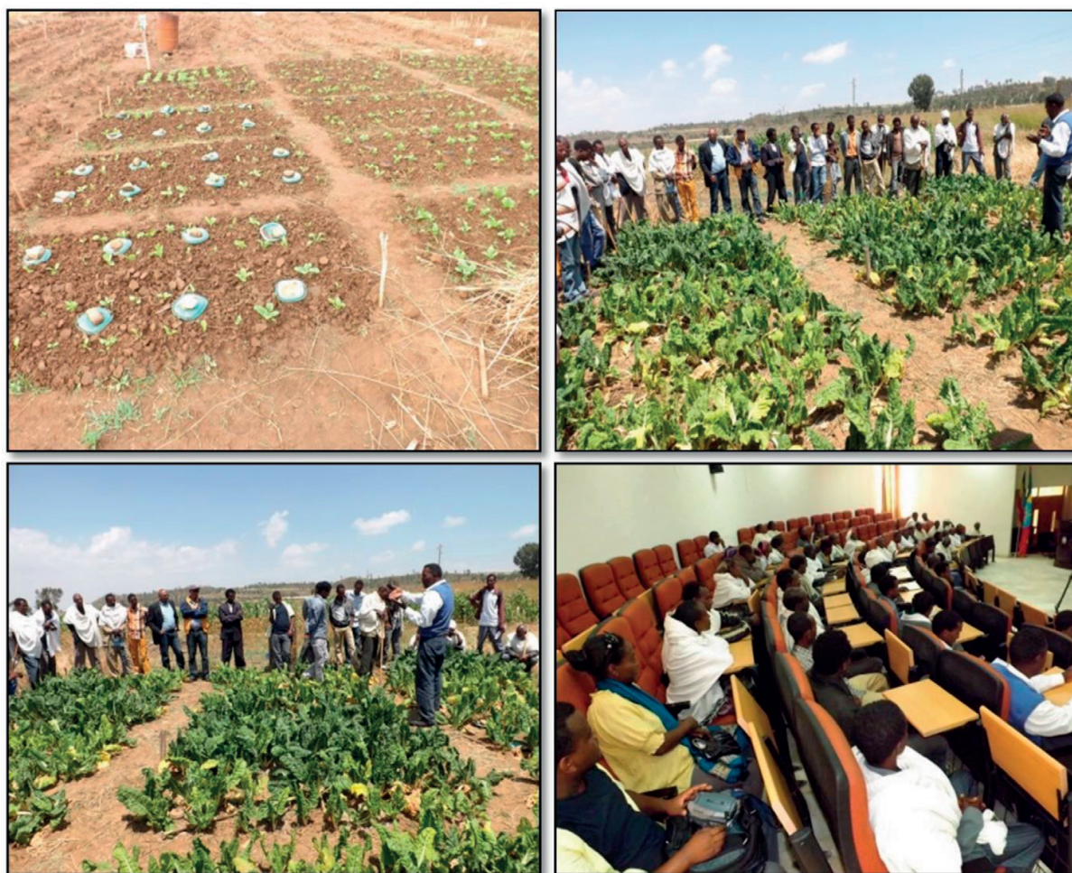
Figure 1. Images showing the demonstration of the project in Africa.

The interactive training and demonstrations delivered to university students, farmers and extension agents have contributed to enhancement of knowledge of using clay pot technology, which has contributed to enhance food productivity in dryland areas of Ethiopia. Cooperation in scientific knowledge sharing and development of partnerships with Brazilian Embrapa scientists has also been enhanced.