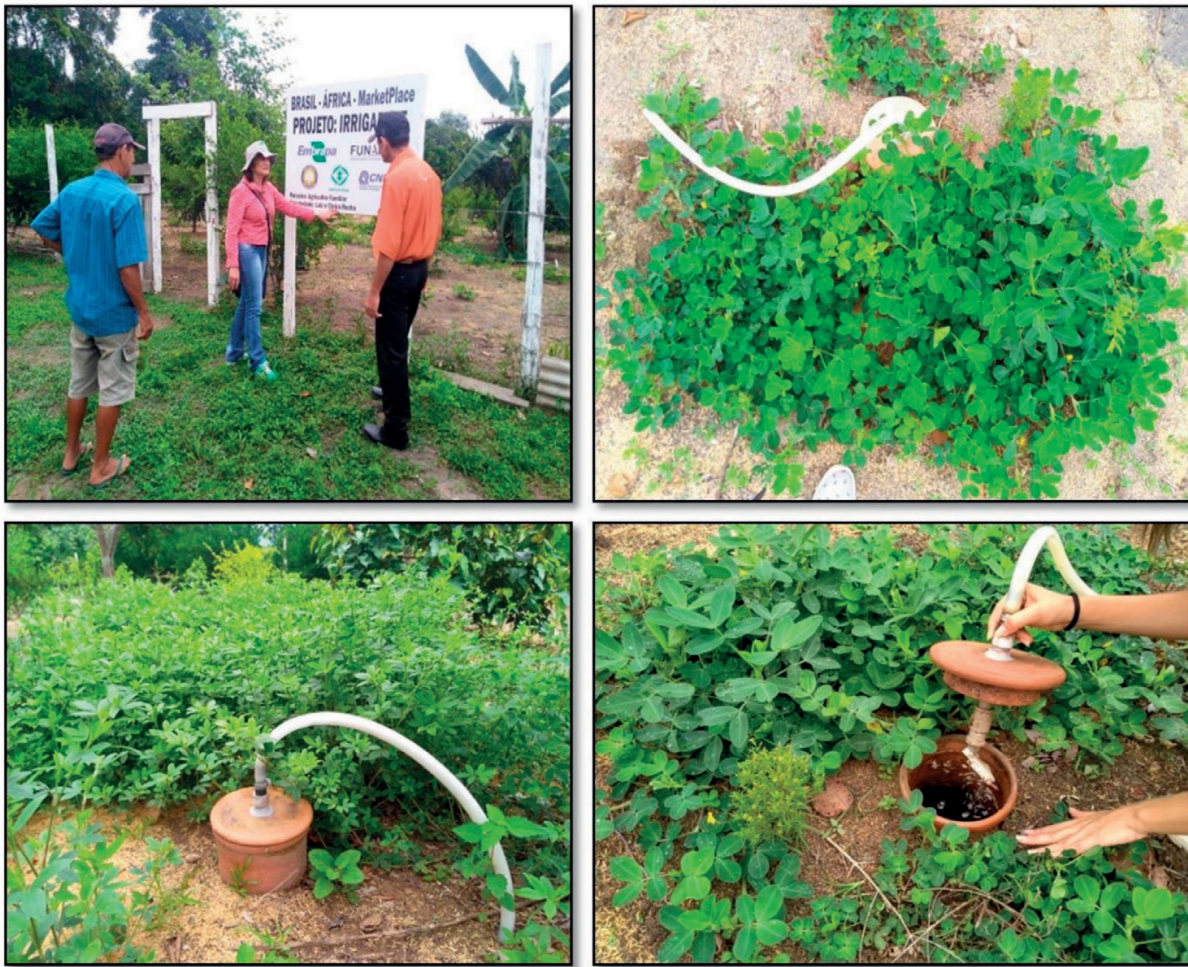
Figure 2. Images showing the experiments installed in the Amazon sharing knowledge obtained from the Brazil partnership.